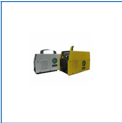
200 AMPS SINGLE PHASE WELDING MACHINE WITH CABLE AND HOLDER

100 mm Self Centering Chuck, 12 Inch Self Centering Lathe Chuck, 13mm Industrial MS Pillar Drill Machine, 13mm MS Pillar Drill Machine, 13mm Pillar Drill Machine, 16 Inch 400Mm X 3 Jaws 4 Jaws Self Centering Chuck, 16mm Industrial Pillar Drilling Machine, 2 HP Industrial Air Compressor, etc.