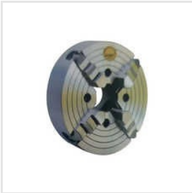
Extra Light Duty 4 Jaw Independent Chuck