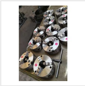
Industrial Self Centering Chuck