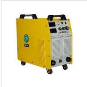
Stud Type Welding Machine