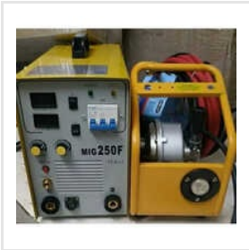
MIG Co2 Welding Machine