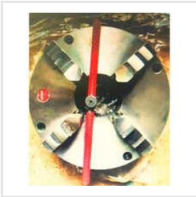
400 Mm And 16 Inch Chuck Self Centre