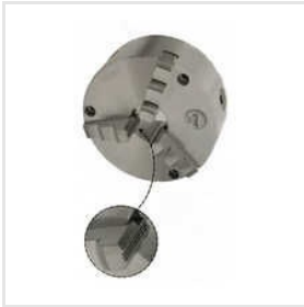
Crank Shaft Grinder Chuck For Automobiles