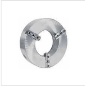
3 Jaw Self Centering Chuck