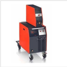
High Tech Welding Machine