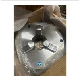
True Sharp 3 Jaws Chuck