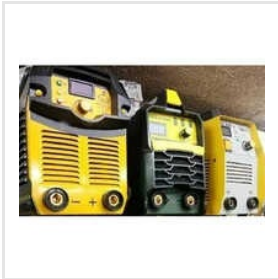
Inverter Welding Machine