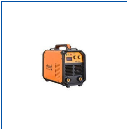
SHAKTI INVERTER WELDING MACHINE