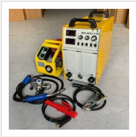
MIG-MAG Welding Machine