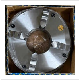
Master Gripping Chuck