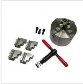
100 Mm Self Centering Chuck