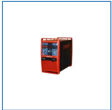
ADOR WELDING MACHINE