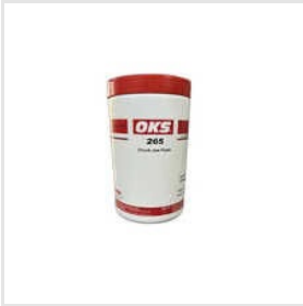
Oks 265 Chuck Jaw Paste