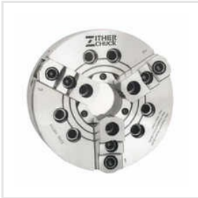
Cnc Machine Power Chuck