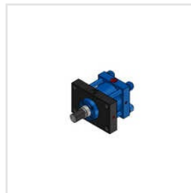
IPH 2 Series 160 Bar Hydraulic Cylinder