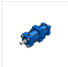
IPH Series 2 Rectangular MT4