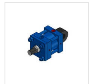
IPH 5 Series 100 Bar Hydraulic Cylinder