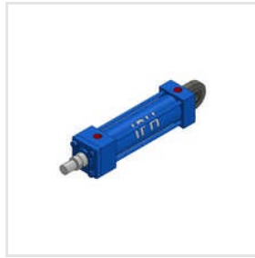
40-28-138-MP5-IPH2 Hydraulic Cylinder