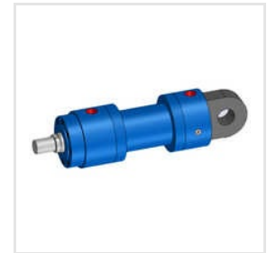
IPH Series 1 Welded Round MP4 Cap