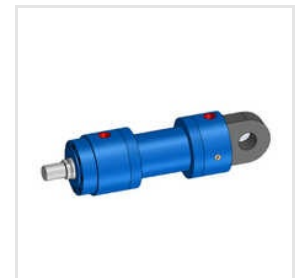
IPH 1 Series 160 Bar Hydraulic Cylinder