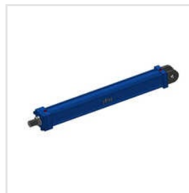
00-70-900-MP1-IPH2 Rectangular Hydraulic