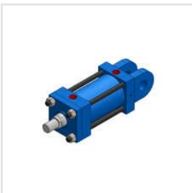
IPH Series 2 Rectangular MP1 Cap