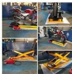
BIKE SCISSOR LIFT