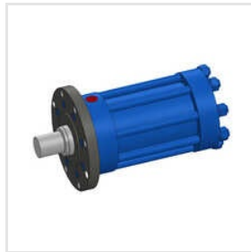
CSTM-200-110-100- MF3 Custom Design