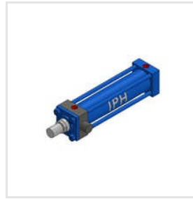
80-56-300-MT1-IPH2 Rectangular Hydraulic