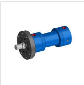
IPH 4 Series 250 Bar Hydraulic Cylinder