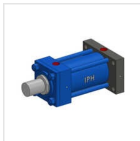
125-90-125-ME6-IPH2 Rectangular Hydraulic