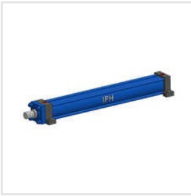
80-56-750-MS2-IPH2 Rectangular Hydraulic