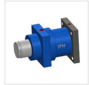
CSTM-250-180-100- MF2 Custom Design