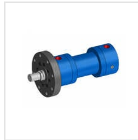
IPH 3 Series 160 Bar Hydraulic Cylinder