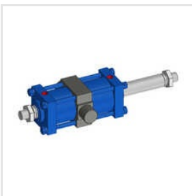
CSTM-200-90-300- MT4 Custom Design