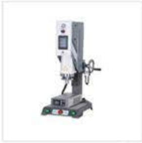
DK.2020D 20Khz Digital Ultrasonic Plastic