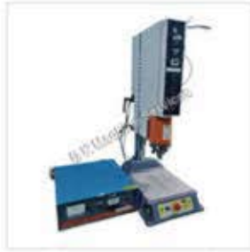
Digital Ultrasonic Welding Machine