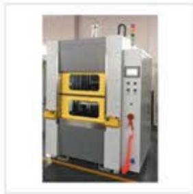
DK.600H Standard Hot-Plate Plastic Welding