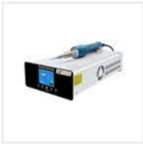
Ultrasonic Spot Welding Machine