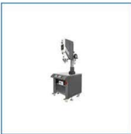
DIGITAL ULTRASONIC PLASTIC WELDING MACHINE

Analog Ultrasonic Plastic Welding Machine, Auto Turning Range Plastic Welding Machine, Digital Ultrasonic Plastic Welding Machine, Hot Plate Tool, Hot-Plate Plastic Welding Machine, Industrial Plastic Welding Machine, Standard Hot-Plate Plastic Welding Machine, Steel Ultrasonic Tooling, etc.