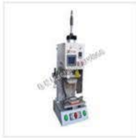
Auto Turning Range Plastic Welding