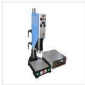
Analog Ultrasonic Plastic Welding