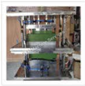
Hot Plate Plastic Welding Tool