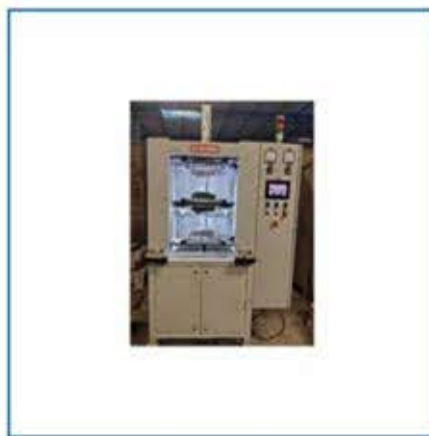
STANDARD HOT-PLATE PLASTIC WELDING MACHINE