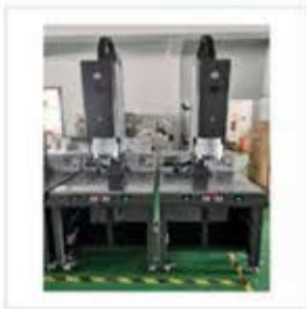
DK 210A Analog Ultrasonic Plastic