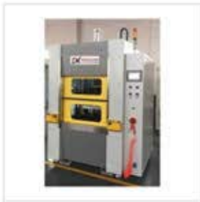
Hot-Plate Plastic Welding Machine