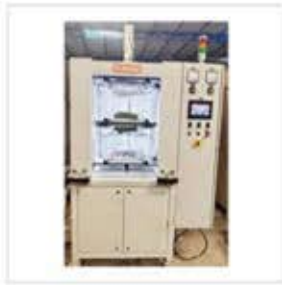
DK.400H Standard Hot-Plate Plastic Welding