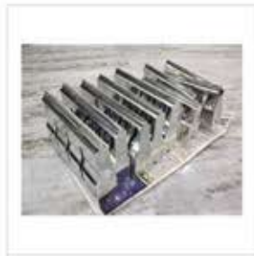
Ultrasonic Horn And Fixture