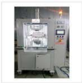
DK.800H Standard Hot-Plate Plastic Welding