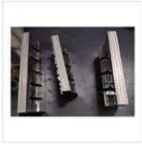
Steel Ultrasonic Tooling