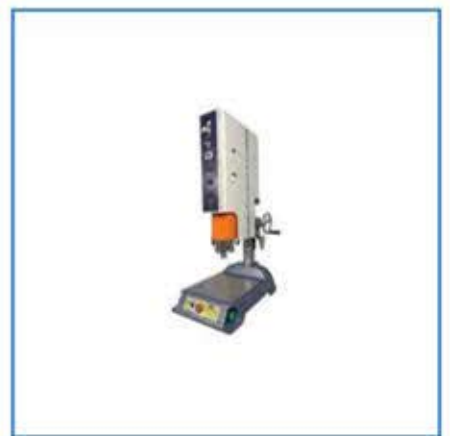
ULTRASONIC PLASTIC WELDING MACHINE