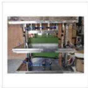
Hot Plate Tool