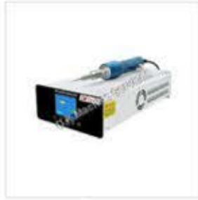
Ultrasonic HandGun Plastic Welding