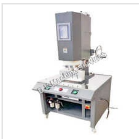
Standard Hot-Plate Plastic Welding