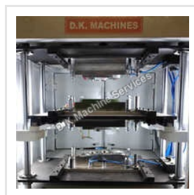
Hot Plate Tool