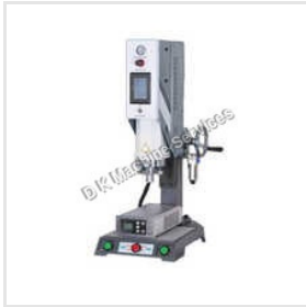
Digital Ultrasonic Plastic Welding