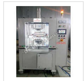
DK.800H Standard Hot-Plate Plastic Welding