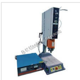
Digital Ultrasonic Welding Machine