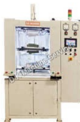
DK.400H STANDARD HOT-PLATE PLASTIC WELDING MACHINE