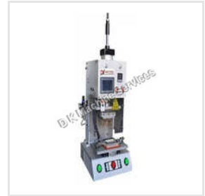
Auto Turning Range Plastic Welding