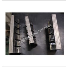
Steel Ultrasonic Tooling