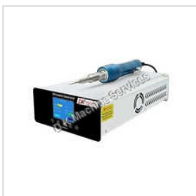
Electric Ultrasonic Power Generator