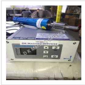
Ultrasonic Spot Welding Machine