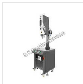
Analog Ultrasonic Plastic Welding