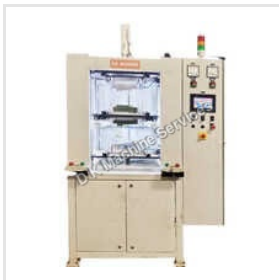
DK.600H Standard Hot-Plate Plastic Welding