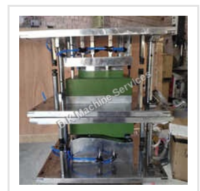
Hot Plate Plastic Welding Tool