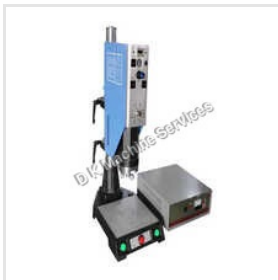
DK 210A Analog Ultrasonic Plastic