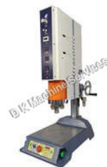
ULTRASONIC PLASTIC WELDING MACHINE