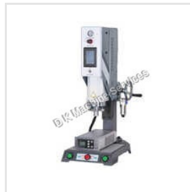
DK.2020D 20Khz Digital Ultrasonic Plastic