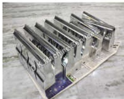
ULTRASONIC HORN AND FIXTURE

Analog Ultrasonic Plastic Welding Machine, Auto Turning Range Plastic Welding Machine, DK 210A Analog Ultrasonic Plastic Welding Machine, DK.2020D 20Khz Digital Ultrasonic Plastic Welding Machine, DK.400H Standard Hot-plate Plastic Welding Machine, DK.600H Standard Hot-plate Plastic Welding Machine, DK.800H Standard Hot-plate Plastic Welding Machine, Digital Ultrasonic Plastic Welding Machine, Digital Ultrasonic Welding Machine, Electric Ultrasonic Power Generator, Hot Plate Tool, Hot plate Plastic welding Tool, etc.