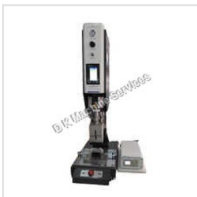
Hot-Plate Plastic Welding Machine