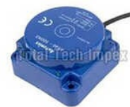
SQUARE PROXIMITY SENSOR