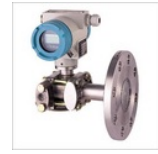
Level Measuring Instrument