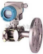
Level Measuring Instruments