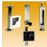
Flow Measuring Instruments