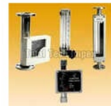
Flow Measuring Instruments