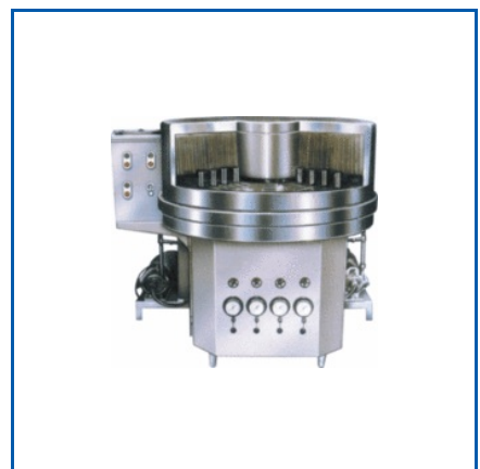
ROTARY BOTTLE WASHING MACHINE