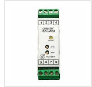
24V DC Signal Isolators And Converters