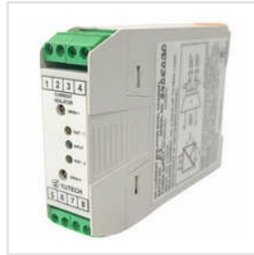
4 MA Dual Output Signal Isolation