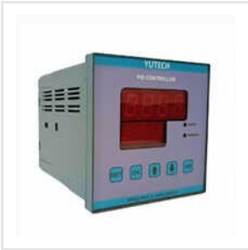
48X96 Mm On Off Control Temperature