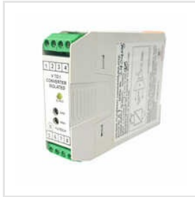
Millivolt To Volt Converter Signal