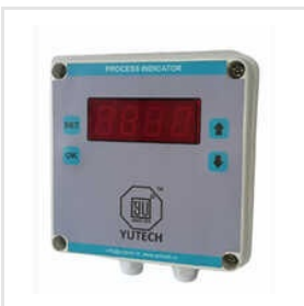
24VDC 0-9999 Process Indicator Controller