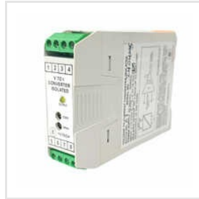
0-10 V Input 4-20 MA Output 1 Channel