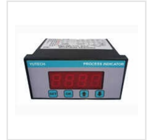
48X48 Mm On Off Universal Process