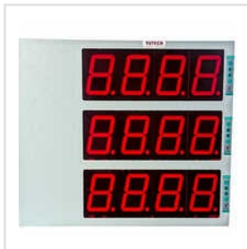
6 Inch 3 Line Jumbo Display Indicator With