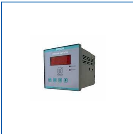
PROCESS INDICATOR DUAL RELAY

0 - 10 V 2 Line Single Side 4 Inch Wall Mounted Jumbo Display Indicator, 0-10 V Input 4-20 mA Output 1 Channel Voltage To Current Converter Signal Isolator, 0-20 MA Input 2W Thermocouple Transmitter, 1 Channel 4-20 mA Input - Output AC Current Transmitter Signal Isolator, 1 Panel Mounted Inch Digital Numeric Process Control Indicator, 10 Inch - 800 Cdm 2 Indoor 7 Segment LED Display, 2.3 Inch Wall Mounted 4 Digit Display, etc.