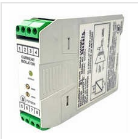
Dual Output Signal Isolator