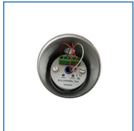
RTD HEAD MOUNTED