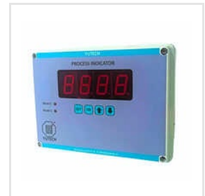
Digital Process Indicator With