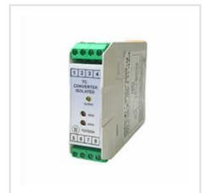
0-20 MA Input 2W Thermocouple