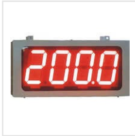
4 Inch 7 Segment LED Wall Mounted Process