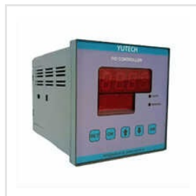
Analog PID Controller Indicator