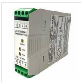
1 Channel 4-20 MA Input - Output AC