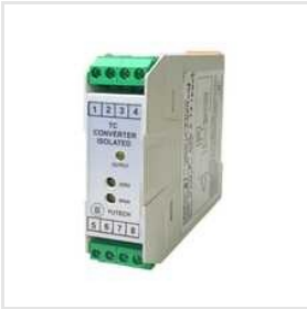
Voltage Current Signal Isolator Converter