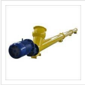
CEMENT SCREW CONVEYOR