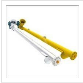
Industrial Screw Feeder