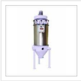
Pneumatic Dust Collector