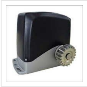
MOTOR - GATE & SHUTTER OPERATORS