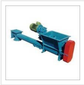
Automatic Screw Feeder