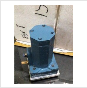
Pneumatic Piston Vibrator