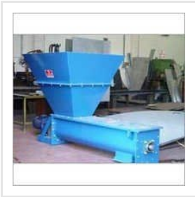
Hopper Screw Conveyor