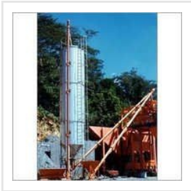
Bulk Material Handling Equipments