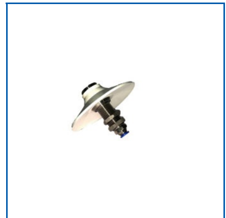
VIBRATING BIN AERATORS