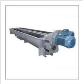
Trough Screw Conveyor