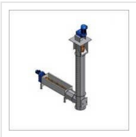
Vertical Screw Conveyor