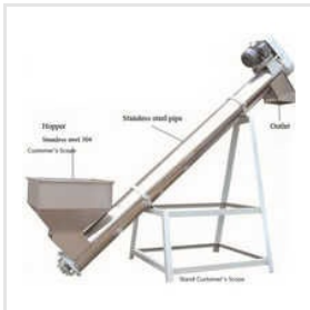
Stainless Steel Screw Conveyor