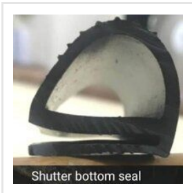
Rolling Shutter Bottom Rubber Seal