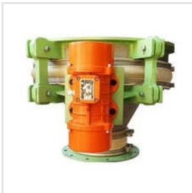
Bin Vibrator Bin Activator