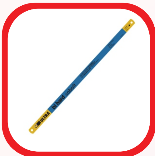
Ultra Bi Hard