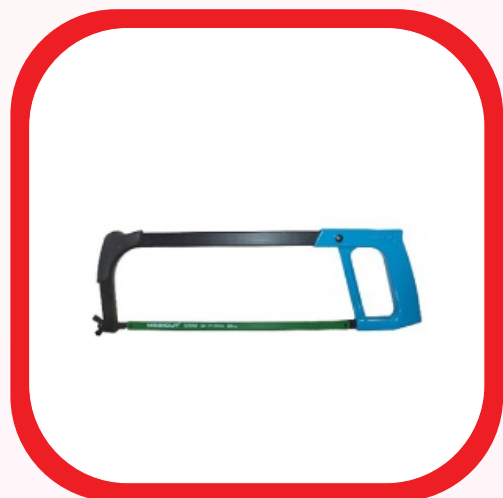
Magicut Aluminum Hacksaw Frame