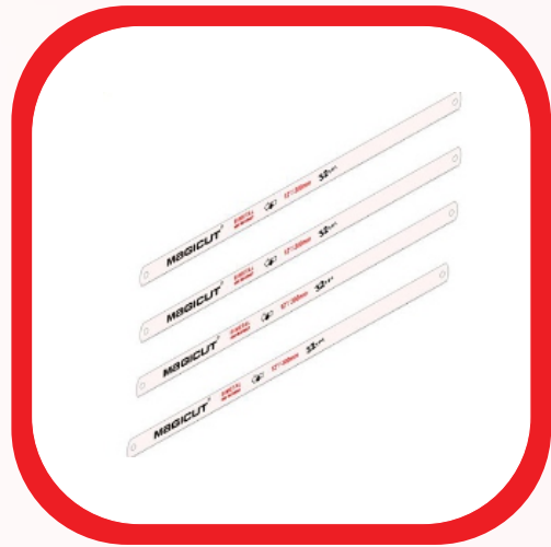
High Speed Steel Blade