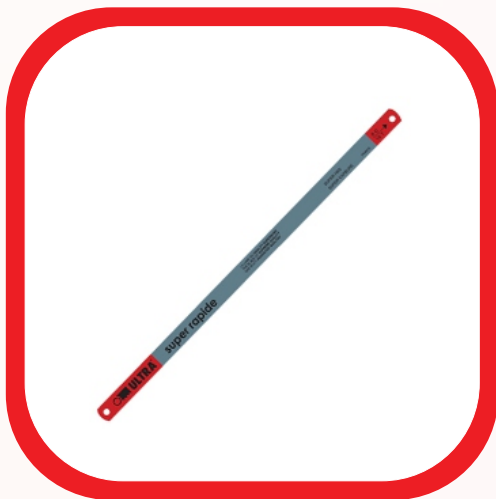
Ultra Super Rapide