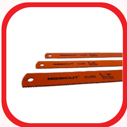
Magicut All Hard HSS Power Hacksaw Blades