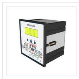
230 V Digital RO Controller