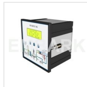
Aster RO Controller (RO-Matic NG)