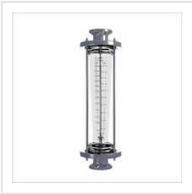
Trichlover Connections Rotameter