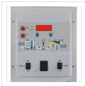
Digital RO Controller