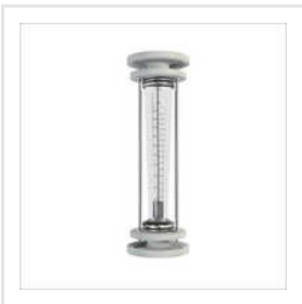
Flanged Connections Rotameter