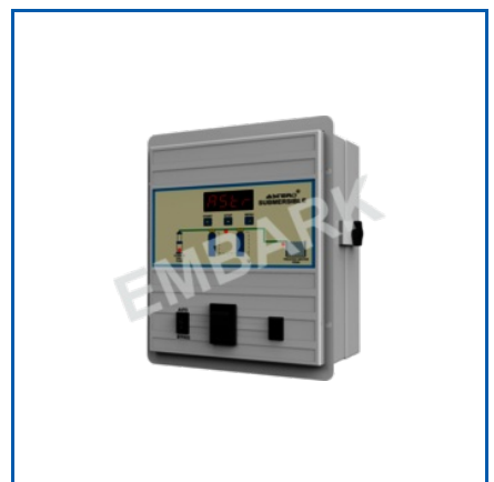
SUBMERSIBLE PUMP CONTROL PANELS