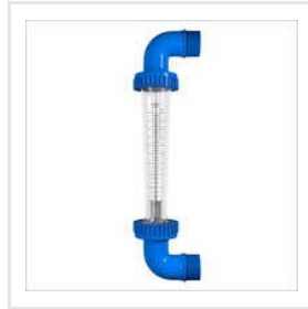
Panel Mounted Rotameter