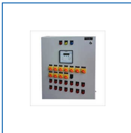
STP ETP CUSTOM BUILT CONTROL PANEL