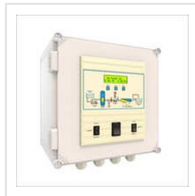
SMS Alerts RO Controller