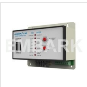
Astero Logic Controller (1MP/3MP)