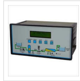
230 V Reverse Osmosis Controller