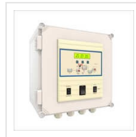
Digital STP Controller