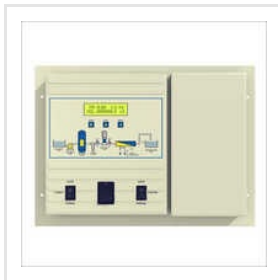
50 Hz RO Controller