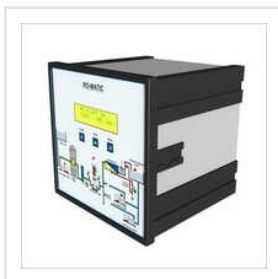
Digital Reverse Osmosis Controller