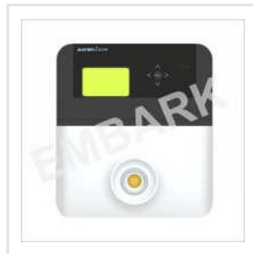
Waste Water RO Controller