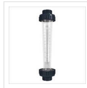
Field Mount Rotameter