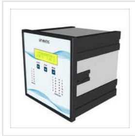
50 Hz Digital RO Controller