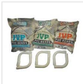
Off White PVC Bend Pipe