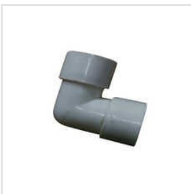
PVC Elbow For Bend