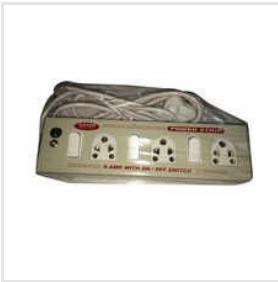
220 V Electric Power Strip