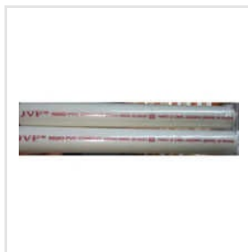
PVC Electrical Pipe