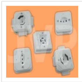
PVC Square Box