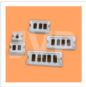
PVC Gang Box