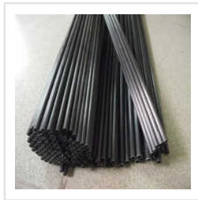
Black PVC Pipe