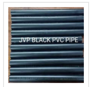
Black Electrical PVC Pipe