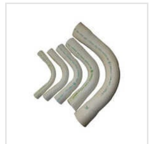
PVC Pipe Bend