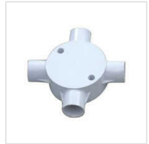
PVC Junction Box