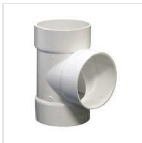
Pvc Pipe Tee