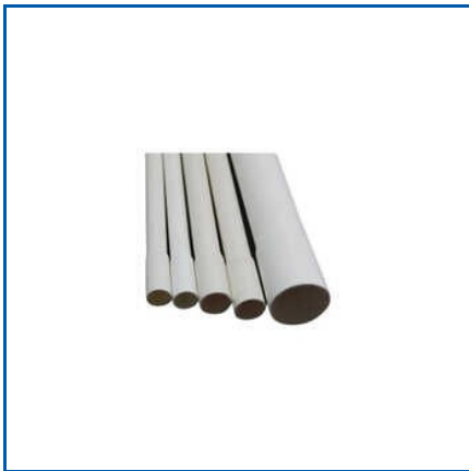
PLASTIC CONDUIT PIPE