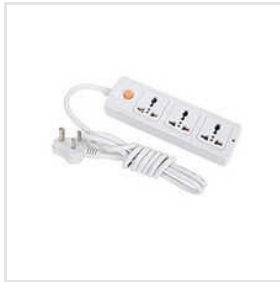
230 V Electric Extension Power Strip