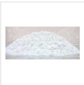
White Calcite Mineral Powder