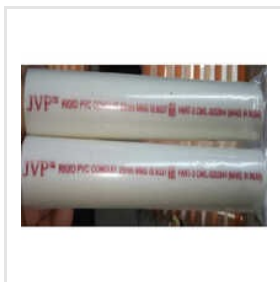
25 Mm Rigid PVC Conduit Pipe