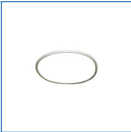
OFF WHITE PLASTIC PIPE