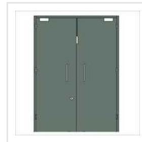
Hollow Metal Double Door