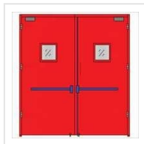
Metal Emergency Exit Door