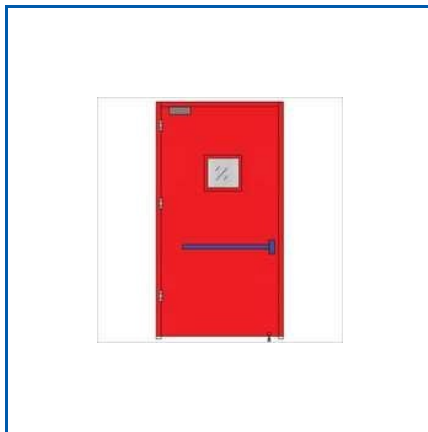
HINGED EMERGENCY EXIT DOOR