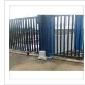
Automatic Sliding Main Gate