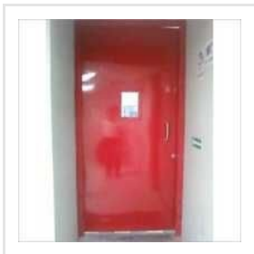
Mild Steel Industrial Fire Resistance Door