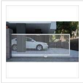
Manual Sliding Gate