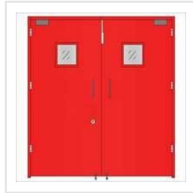
Metal Hinged Fire Safety Door