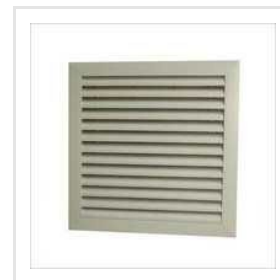
Fresh Air Louver