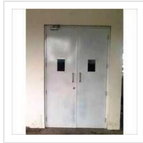
Hollow Metal Pressed Steel Double Door