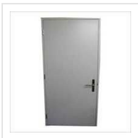
Hollow Metal Pressed Steel Single Door