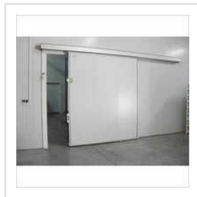
Industrial Steel Sliding Door