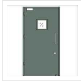
Hollow Metal Hinged Double Door