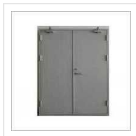
Industrial Fire Resistant Door