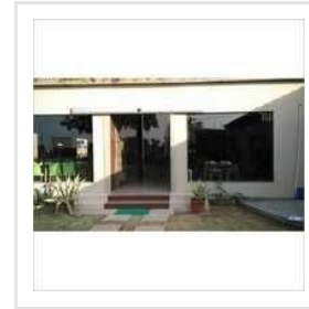
Automatic Sliding Glass Door