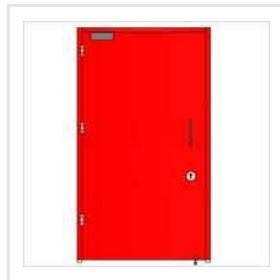
Steel Fire Safety Door