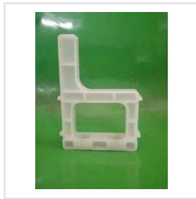
Filter Plates Handle