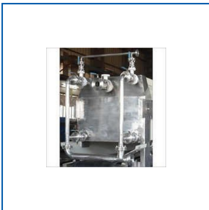
SS FILTER PRESS

40 And 48 Handle, Chamber Filters Plates, Customized Filter Plate, Double Brick Mould with Ejector and Name, Filter Cloth Holder, Filter Plate Accessories, Filter Plates Handle, Filter Plates Handles, Fully Automatic Filter Press, HDPE Block, HDPE Spacer, Manual Hydraulic Filter Press, Membrane Plates, PP Circle, PP Grommet, etc.