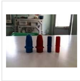
Filter Cloth Holder