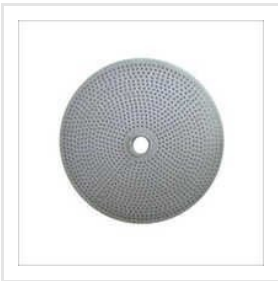
Customized Filter Plate