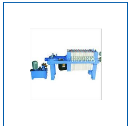
MANUAL HYDRULIC FILTER PRESS