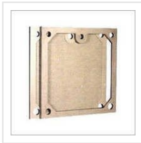
Plate And Frame Type Filter Plates