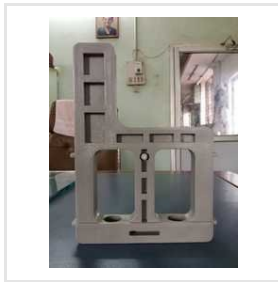
Filter Plates Handles