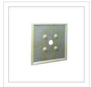
Plate Used In Ceramic Industries