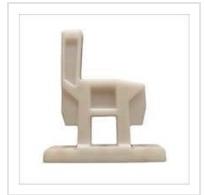
40 And 48 Handle