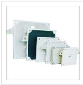
Chamber Filters Plates