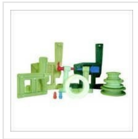
Filter Plate Accessories