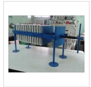
Pilot Filter Press