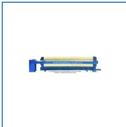
FULLY AUTOMATIC FILTER PRESS