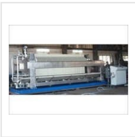
Stainless Steel Filter Press Plates