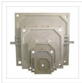
Recessed Chamber Filter Plates