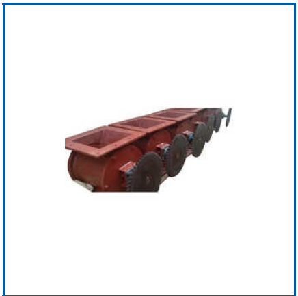
MS COAL INJECTOR