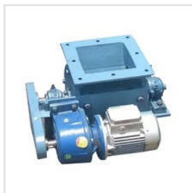
Rotary Airlock Valve