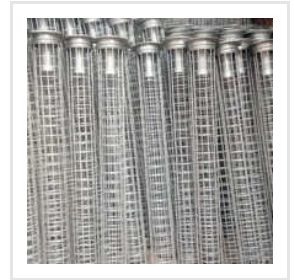
Bag House Filter Spares