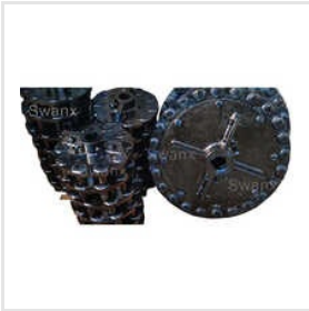
EN8 Pin Wheel