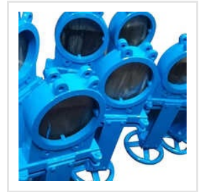
Manual Slide Gate