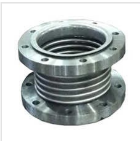
Metallic Expansion Joint Bellow