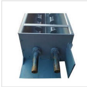
Ash And Dust Conditioner