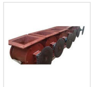
MS Coal Injector