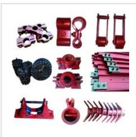
ESP Rapping Mechanism Spares