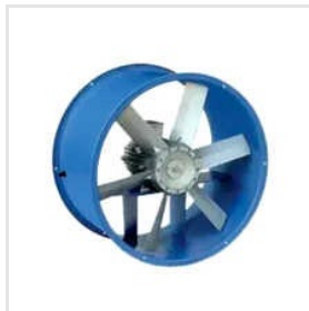
Industrial ID And FD Fan