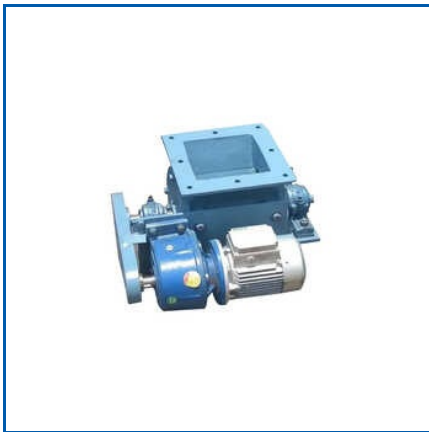
ROTARY AIRLOCK VALVE

Rotary Airlock Valve, Screw Conveyor, Coal Injector, Ash Conditioner, ESP Components, Slide Valve Gate, Pulse Jet Filter Bag Spares, Industrial Dampers Expansion Join Bellow, ID And FD Fan