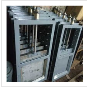
Motorized Slide Gate