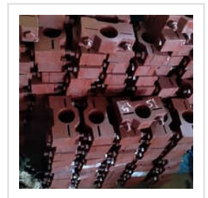
ESP Plain Bearings