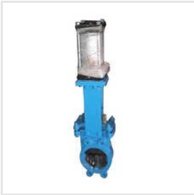
Pneumatic Slide Gate