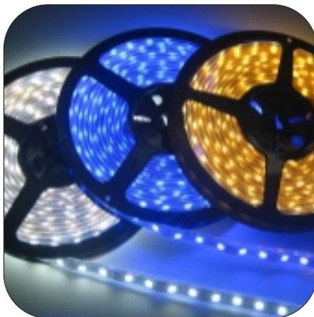
Led Strip Light