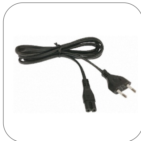
Moulded Wire Plug Cords