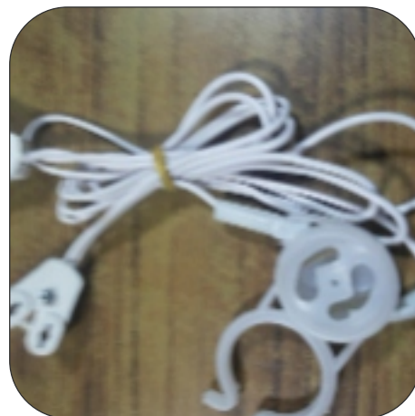
Moulded Wire Plug Cords