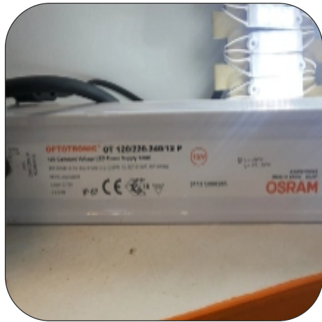
Led Water Proof Supply