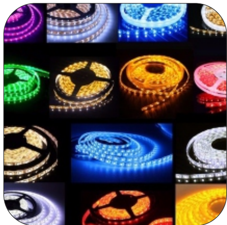
LED Strips Light