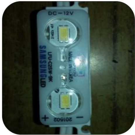
Samsung Led Module