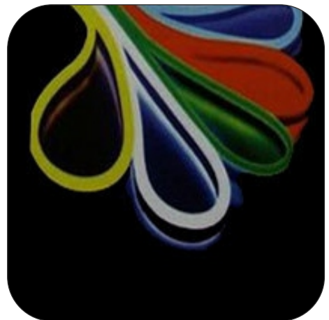
Neon Rope Light