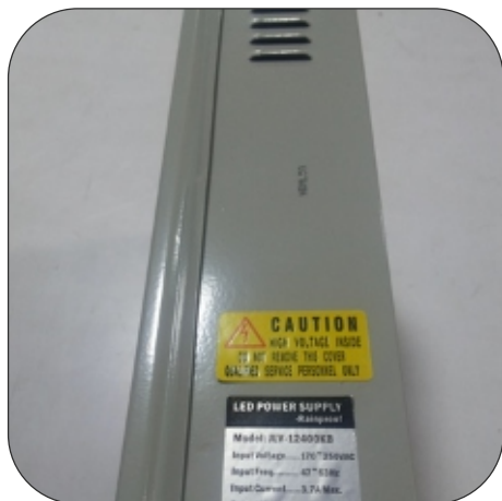
Led Waterproof Power Supply