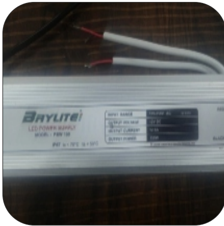
Led Waterproof Supply