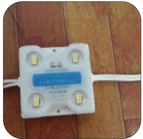
Samsung Led Module