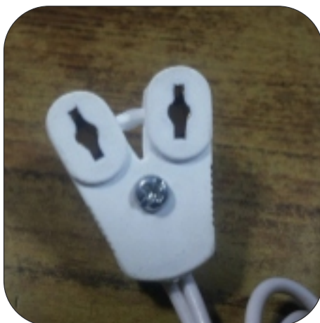
Moulded Wire Plug Cords