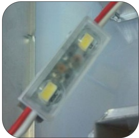
Transparent 2 Smd Led module