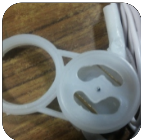
Moulded Wire Plug Cords