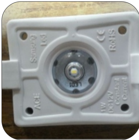
Samsung Led Module