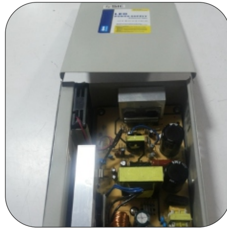
Led Light Waterproof Supply