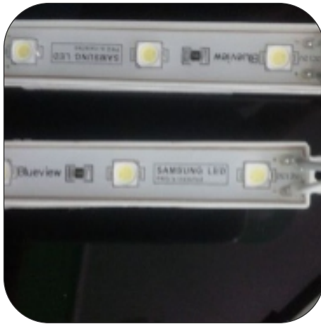
Samsung Led Module