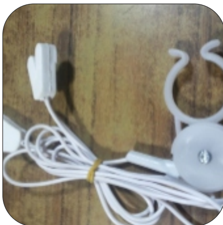
Moulded Wire Plug Cords