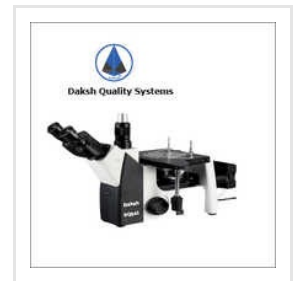
DQS-4I Metallurgical Microscope