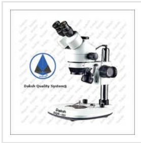
Laboratory Stereo Zoom Microscope