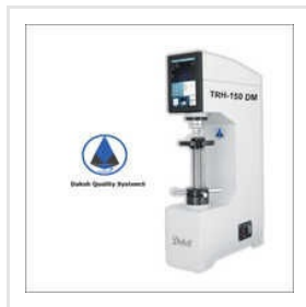
Advanced Digital Rockwell Hardness