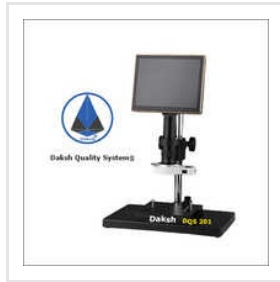
Monozoom Stereo Microscope