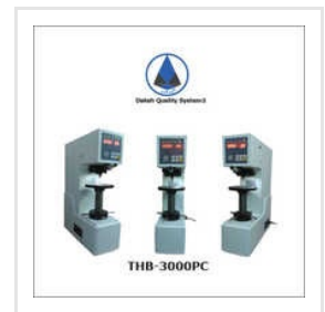
Computerized Brinell Hardness Tester