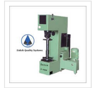
Industrial Computerised Brinell