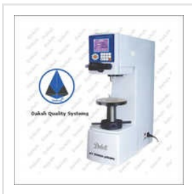
HT 3000H-3000PC Advanced Brinell