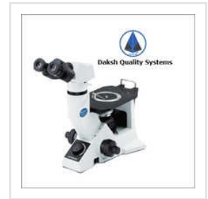
GX41 Metallurgical Microscope