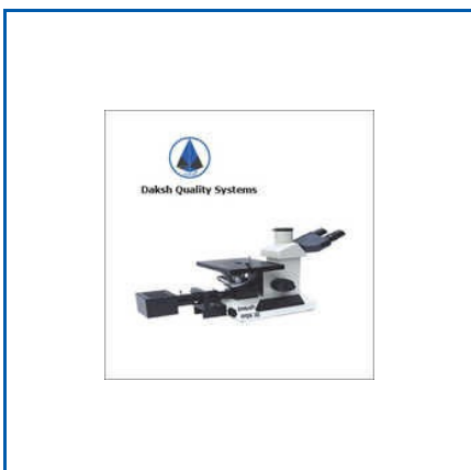
DQS-3I METALLURGICAL MICROSCOPE

Advanced Digital Rockwell Hardness Tester, Analogue Rockwell Hardness Tester, Computerized Brinell Hardness Tester, Computerized Profile Projector, Computerized Touch Screen Universal Testing Machine, Computerized Touch Screen Vickers Hardness Tester, DQS-3I Metallurgical Microscope, DQS-4I Metallurgical Microscope, DQS-5I Metallurgical Microscope, DQS-5U Upright Metallurgical Microscope, etc.