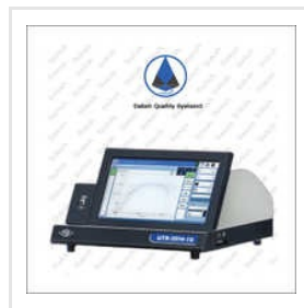
UTE-2014-TS Computerized Touch