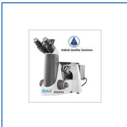
DQS-5I METALLURGICAL MICROSCOPE