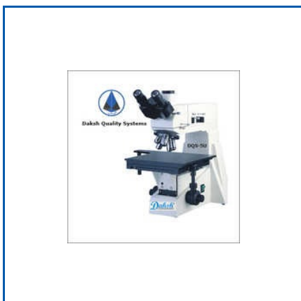
DQS-5U UPRIGHT METALLURGICAL MICROSCOPE