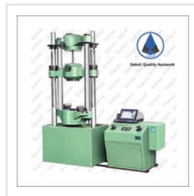
Computerized Touch Screen Universal