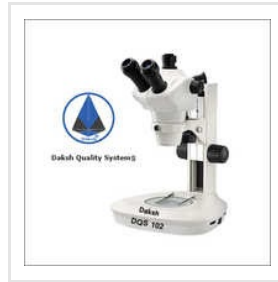
Stereo Zoom Microscope