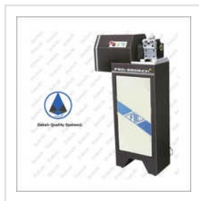
Pro Broach Automatic Broaching Machine