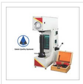
Analogue Rockwell Hardness Tester