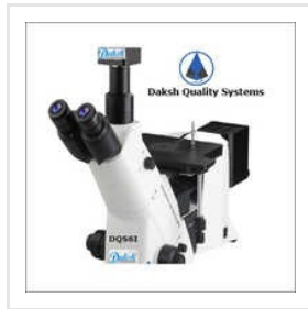
DQS-6I Metallurgical Microscope