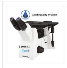
DQS-7I Inverted Metallurgical