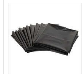
Plastic Black Garbage Bag