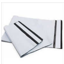
Tamper Proof Plastic Courier Bag