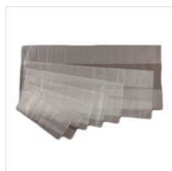
Plastic Kirana Bag