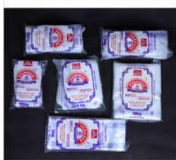
100 Percent Plastic Virgin Bag