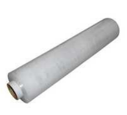
Cling Film Roll