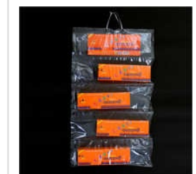
Agarbatti Plastic Bag