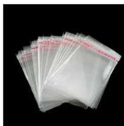
PLASTIC PACKAGING BAG