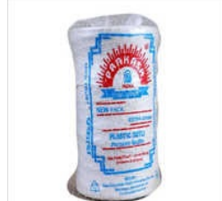
Premium Quality Plastic Suti