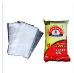
Plain LLDPE Bag