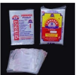
50 Micron Plastic Bag