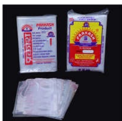
51 Micron Plastic Bag