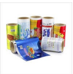
Printed Plastic Packaging Roll