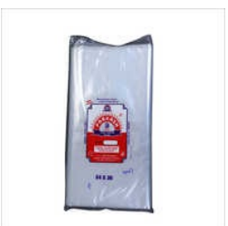
24 X 36mm Plain Plastic Bag