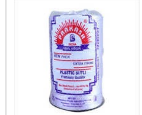
100 Percent Virgin Plastic Suti