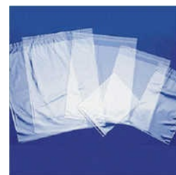
PP PLASTIC BAG