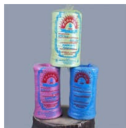
Colored Plastic Suti