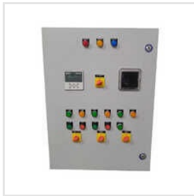
Industrial VFD Panel