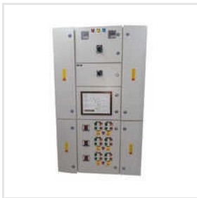
Industrial Water Treatment Plant