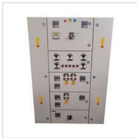
MS Water Treatment Plant Control Panel