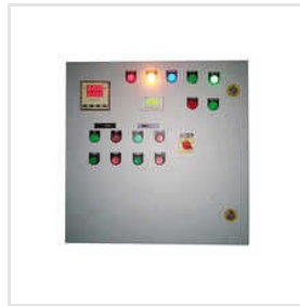
VFD Control Panel