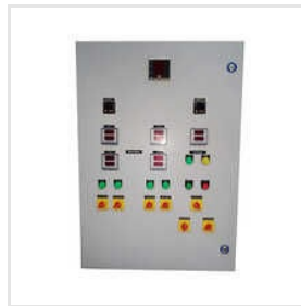
Hot Water Circulation Panel