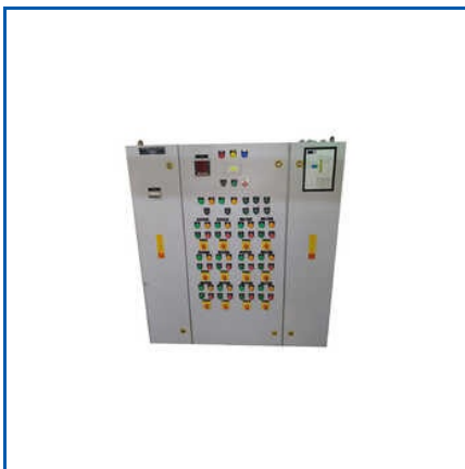
UF PANEL WITHOUT HMI

Automatic Synchronizing Panel, DG Synchronization Panel, Electrical Control Panel Board, Motor Control Center Panels, PCC Panel, Process Control Panel, RO Panel, etc.