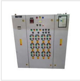
UF Panel Without HMI