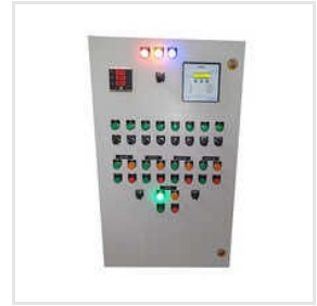
UF Panel With Controller