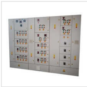
Motor Control Panel