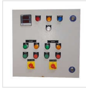
Water Softener Panel