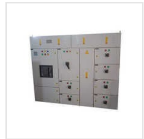
Power Control Panel