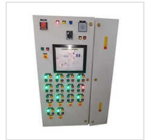
STP Panel With MIMIC