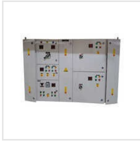
Fire Control Panel