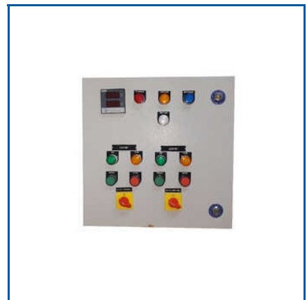
WATER SOFTENER PANEL