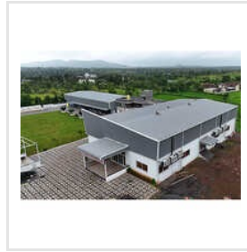
Commercial Multipurpose Hall