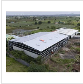
Commercial Peb Shed