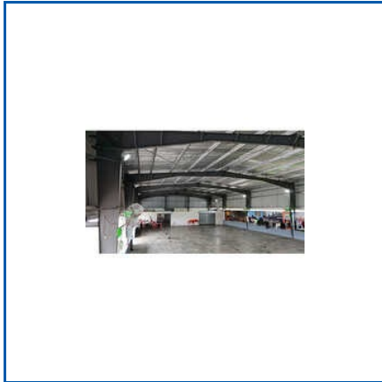
COMMERCIAL MS MULTIPURPOSE HALL