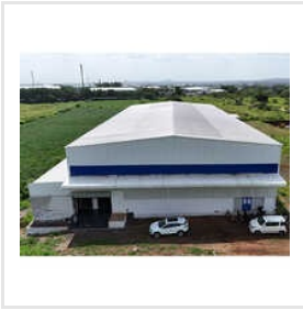
Pharma Industries Peb Structure