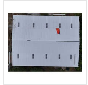
Commercial Peb Shed.