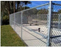
Chain Link Fencing Wire