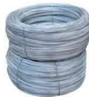
Cable Armouring Round Wires