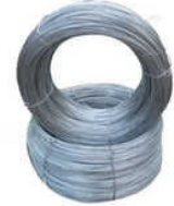
Hot Dip GI Wire