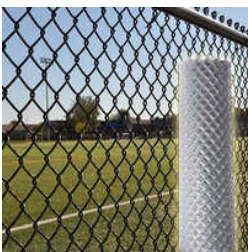
Chain Link Wire