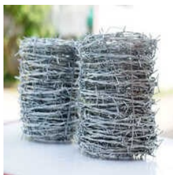
Gi Barbed Wire