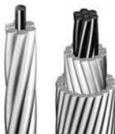
ACSR CORE WIRE