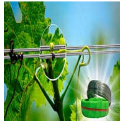
Hot Dip Galvanized Wire