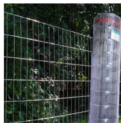
Gi Welded Mesh Wire