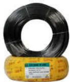
High Carbon Rope Wire