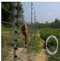
Solar Fencing Wire