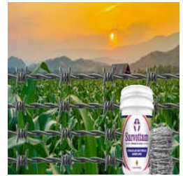
High Tensile Barbed Wire