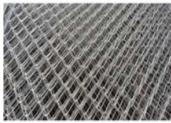
Iron Chain Link Fencing Wire