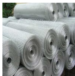
GI Weld Mesh Wire