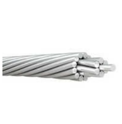
Aluminium Conductor Steel Reinforced Core