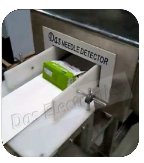
Ferrous Metal Detectors