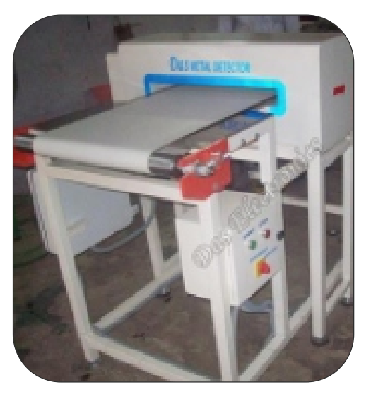
Conveyorised Metal Detector