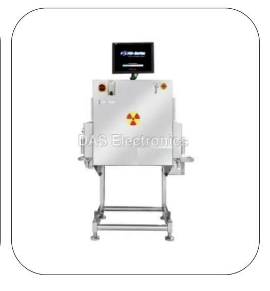
Foil Metal Detector