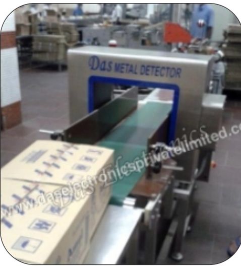
Metal Detector System