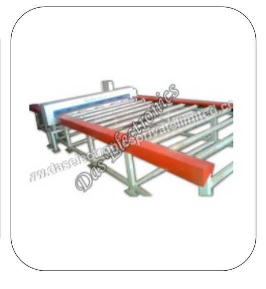
Laminate And Plywood Metal Detector