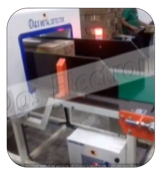
Digital Metal Detector