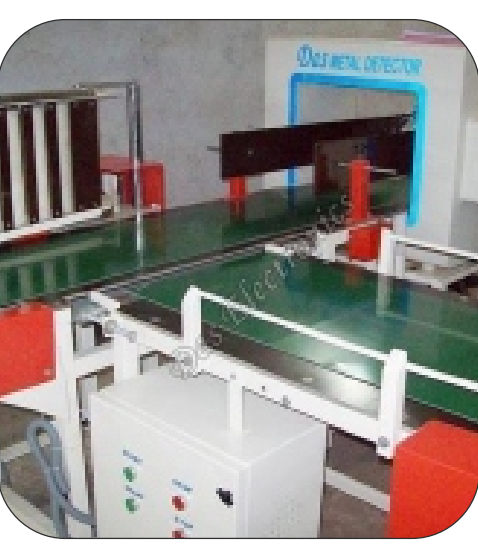
Online Bag Metal Detector