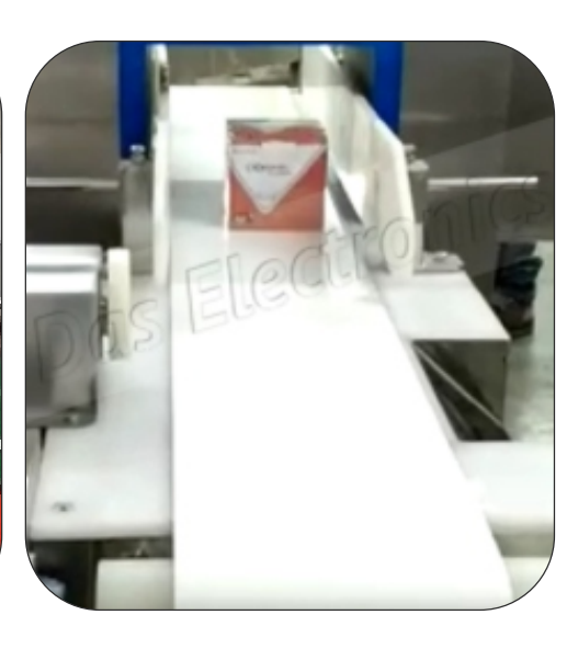
Metal Detector for Aluminium Foil Products