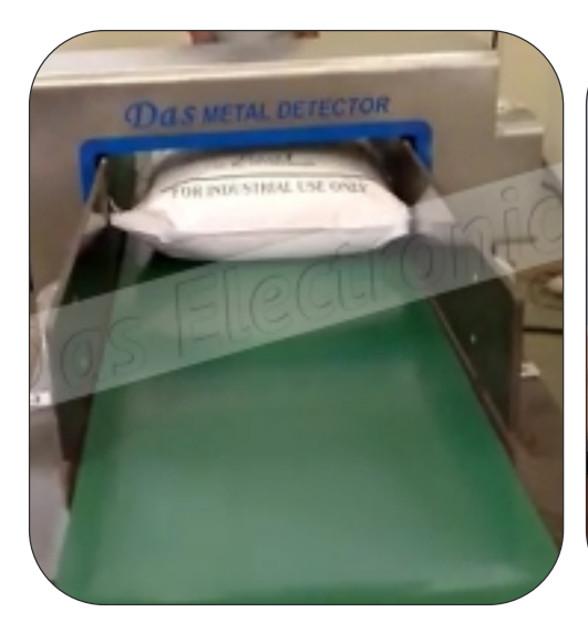
Jumbo Bag Metal Detector