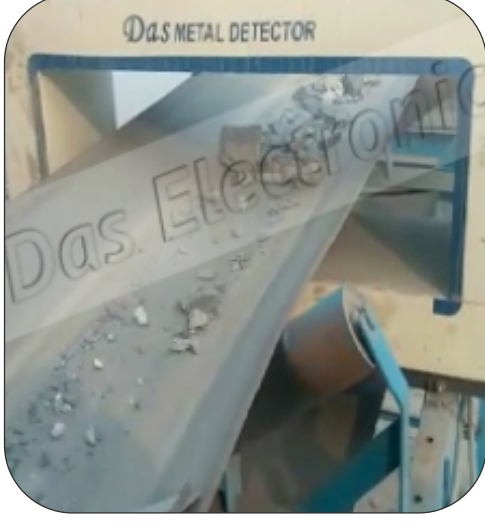
Metal Detector For Stone Crusher