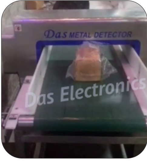
Stainless Steel Metal Detector