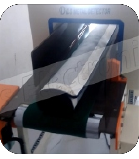
Home Furnishing Metal Detector