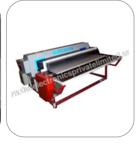
Ferrous Metal Detector