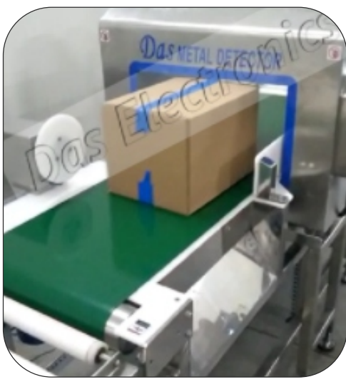
Checkweigher And Metal Detector Combination