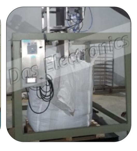
Gravity Feed Metal Detector