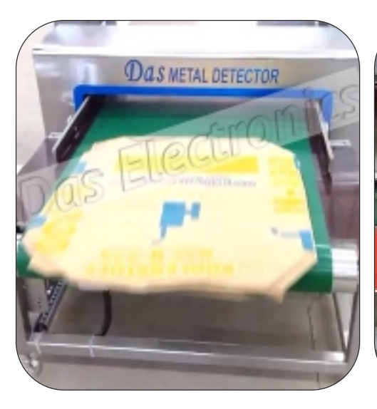
Aluminum Packaging Metal Detector