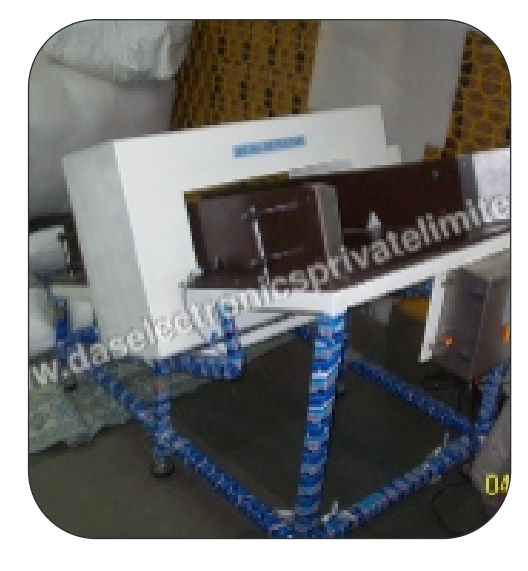
Incline Type Metal Detector