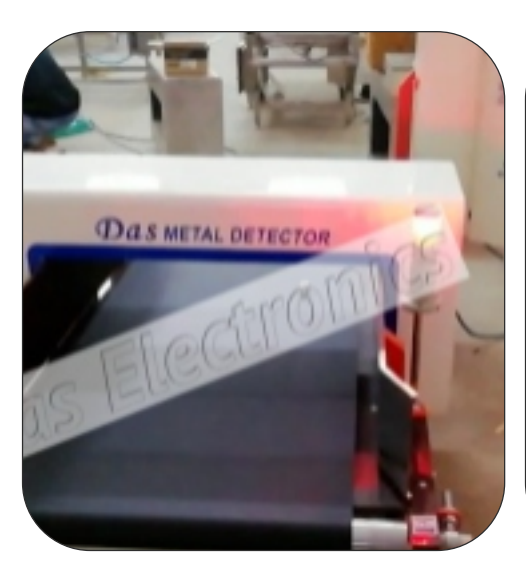
Metal Detector for Plastic Scrap