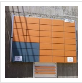
Framing System For Wall Tile Cladding