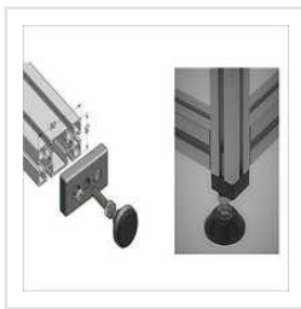
Adjustable Leveling Foot