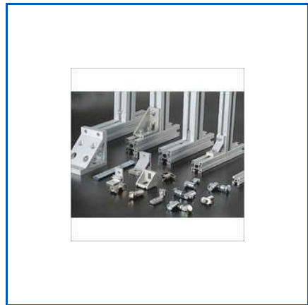
ALUMINIUM MODULAR PROFILES