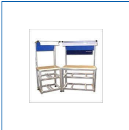
ERGONOMIC WORKSTATION PROFILES