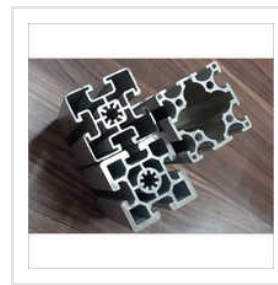
60 Series Aluminium Profiles