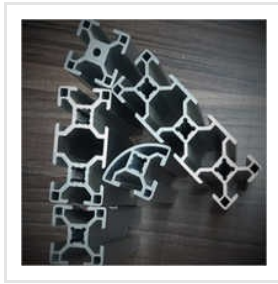
30 Series Aluminium Profiles