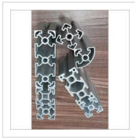
40 Series Aluminium Profiles