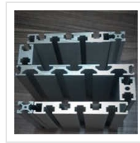
15 Series Aluminium Profiles