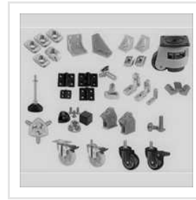
Aluminium Profile Accessories