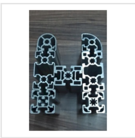
45 Series Aluminium Profiles