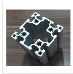
90 Series Aluminium Profiles