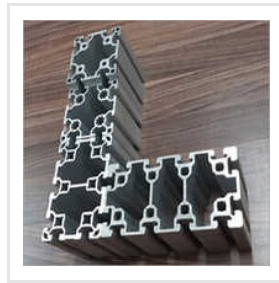
80 Series Aluminium Profiles