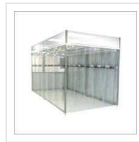
Clean Room Profile