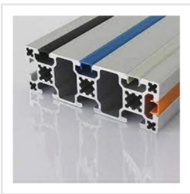
Slot Cover Beading