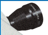
Examine at arms length