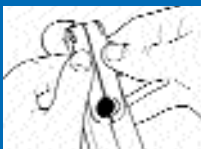
2 Spread the case halves apart.