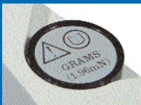
Versatile and Accurate