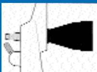
3 Insert PET into the viewing aperture