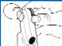
1 Loosen forehead rest screw.