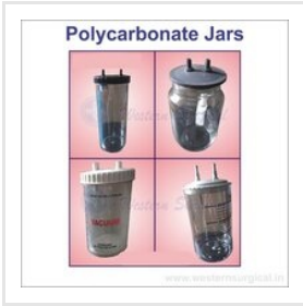
Suction Jars Polycarbonate