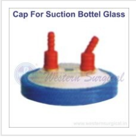
Cap For Suction Bottel PVC Glass For Medical