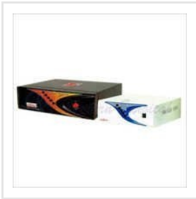
0059 MEDICAL BATTERIES