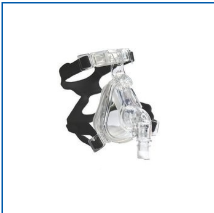
BIPAP MASK LARGE

"k" Wire (double Ended), "l" Buttress Plate, "t" Buttress Plate, 'l' Hook, 'l' Hook Ptf, (circuit Adaptors - Plastic), 0029 P 29 a Medical Batteries, 0036 Oxygen Concentrator Flow/single Dual Flow, 0037 Oxygen Concentrator Flow/single Dual Flow, 0038 Oxygen Concentrator Flow/single Dual Flow, 0039 Oxygen Concentrator Flow/single Dual Flow, Etc.