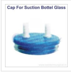
Cap For Suction Bottle Glass