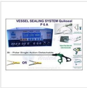
VESSEL SEALING SYSTEM Quikseal