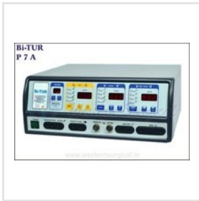
BI - TUR