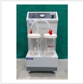
Powervac Suction Machine