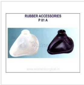
P 81 A RUBBER ACCESSORIES