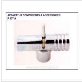
P 157 A APPARATUS COMPONENTS AND