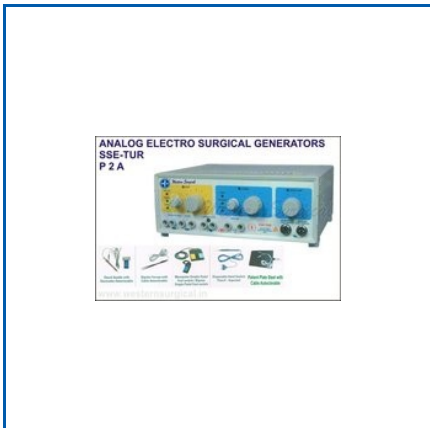
ANALOG ELECTRO SURGICAL GENERATORS