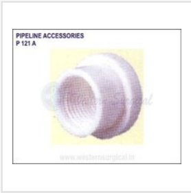
P 121 A PIPELINE ACCESSORIES