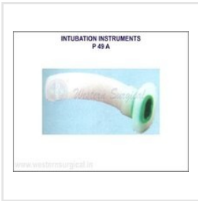
P 49 A INTUBATION INSTRUMENTS