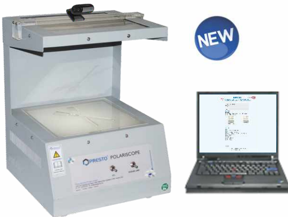
Model PPC - 203

Defects in PET Preforms are easily identifiable using the Polariscope PET Preform Strain Viewer Crystallinity is readily identified. Not only can the molecular birefringent flow lines (frings) be seen in colour but the black isoclinic lines are visible when the preform axis are parallel to the polarizing axis of the viewer. Completely imported Kit. Includes