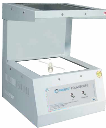
Model PPS - 400