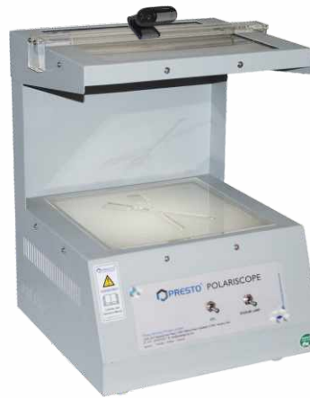
Model PPC - 203