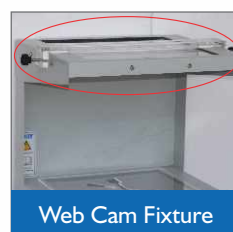
Web Cam Fixture