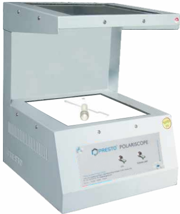
Model PPS - 400

Defects in are easily identifiable using the Polariscope Strain Viewer Crystallinity is readily identified. Not only can the molecular birefringent flow lines (frings) be seen in colour but the black isoclinic lines are visible when the preform axis are parallel to the polarizing axis of the viewer. Completely imported Kit. Includes