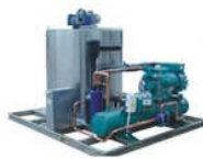
Tube Ice Making Plant