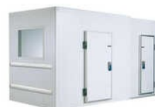
20 Ton Fruits Ripening Chamber