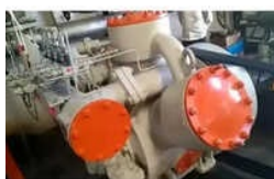
200HP Ammonia Compressor