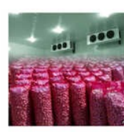
VEGETABLE COLD STORAGE