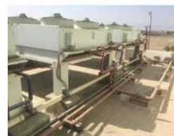
Air Cooled Condenser