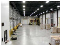
COMMERCIAL COLD STORAGE

20 Ton Fruits Ripening Chamber, 200HP Ammonia Compressor, 440V Cold Storage Room, Air Cooled Condenser, Banana Ripening Chamber, CA Cold Storage, Cold Storage Consultant Services, Cold Storage Erection Services, Commercial Cold Storage, Compact Chilling Plant, Copper Industrial Chiller, FRP Steel Cold Room Condensing Unit, Frozen Cold Storage, Galvanize Ice Can, MA Cold Storage, etc.