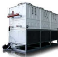
Steel Evaporative Condenser