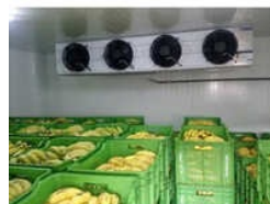
Banana Ripening Chamber