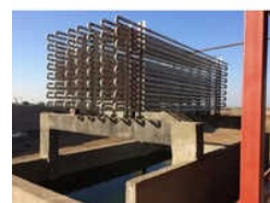
Single Atmospheric Condenser