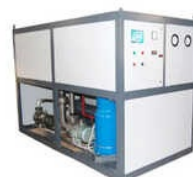
Copper Industrial Chiller