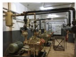
Semi-Automatic Ice Making Plant