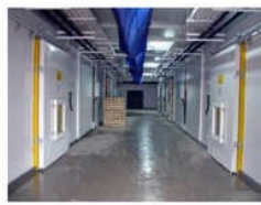
CA COLD STORAGE