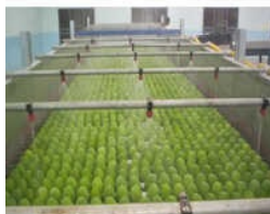
Mango Ripening Chamber