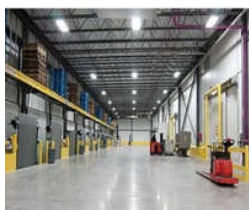
Frozen Cold Storage