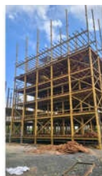
Cold Storage Erection Services