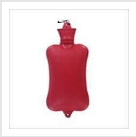
Rubber Hot Water Bags