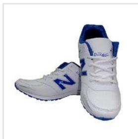
Sport Shoes Ss0201