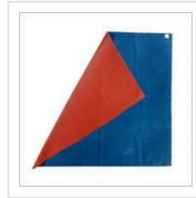
Hospital Rubber Sheet