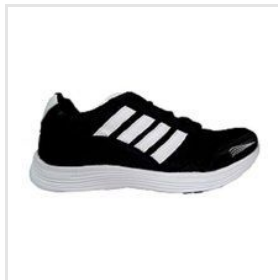
Sport Shoes Ss31