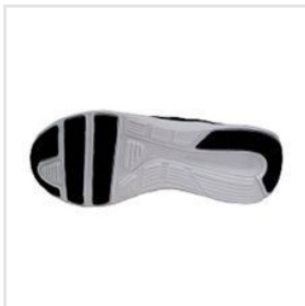
Sport Shoes Ss25