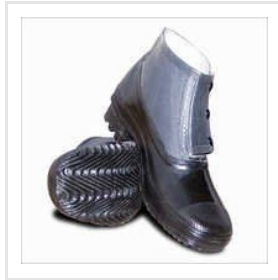
Rubber Ankle Boot