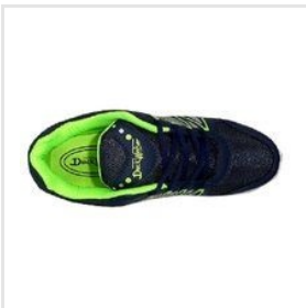
Sport Shoes Ss004