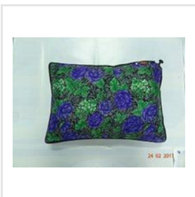
Air Pillow RDX