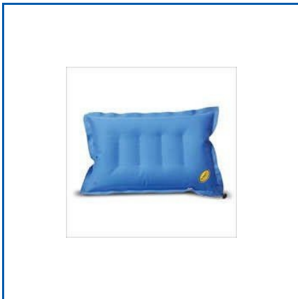
DOUBLE COLOR AIR PILLOW

Air Pillow RDX, Ambassador, Aqua bags, Baby Dry Sheets, Backpack bags 807, Big star bags, Biker Rainsuit, Blacky bags, Blaze & bravo bags, Boys School Bags, Canvas Boots, Chancellor laptop bags, Child School Bags, Circle bags, Climb bags, etc.