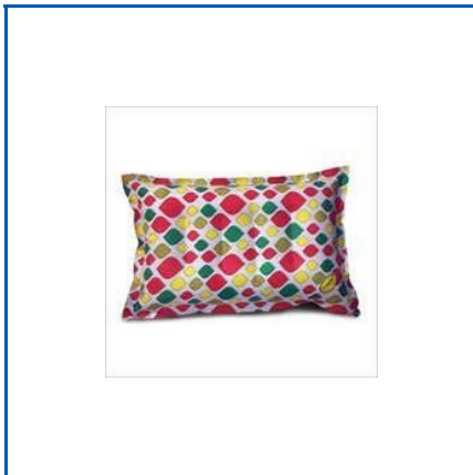
PRINTED AIR PILLOW