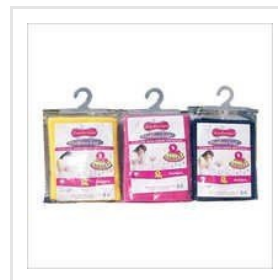
Baby Dry Sheets