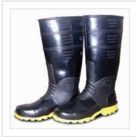
PVC Wellington Gumboot