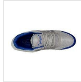
Fancy Sports Shoes