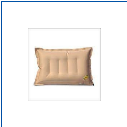
KHAKI AIR PILLOW