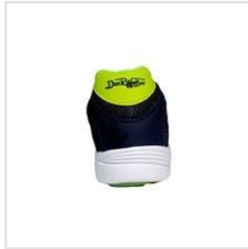
Sport Shoes Ss29