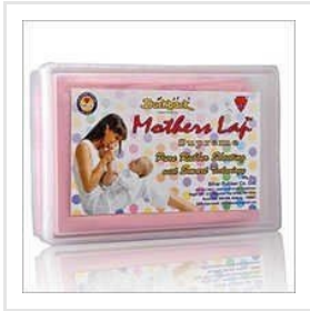
Supreme Rubber Sheets