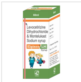
Levocetirizine & Montelukast Syrup