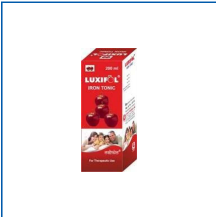
FERRIC AMMONIUM CITRATE FOLIC ACID CYANOCOBALAMIN