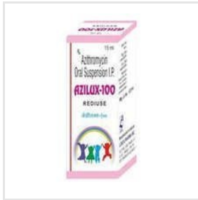
Azithromycin Suspension 100mg