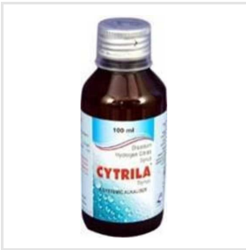
Disodium Hydrogen Citrate Syrup