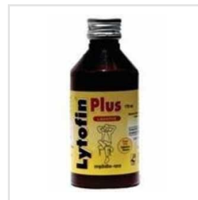
Liquid Paraffin Syrup