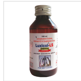
Levosalbutamol Ambroxol &