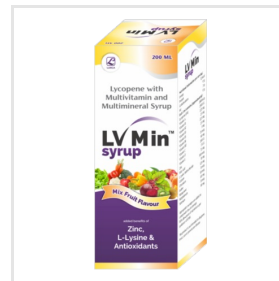
Multivitamin & Multi Mineral Syrup With