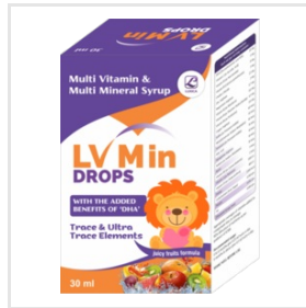
Multi Vitamin & Multi Mineral Drops With