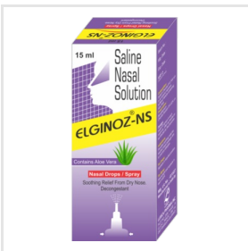
Sodium Chloride Nasal Drops