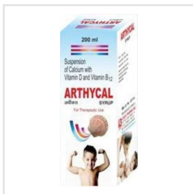
Vitamin D3, Calcium & Vitamin B12 Syrup