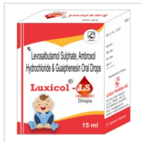
Levosalbutamol Ambroxol &