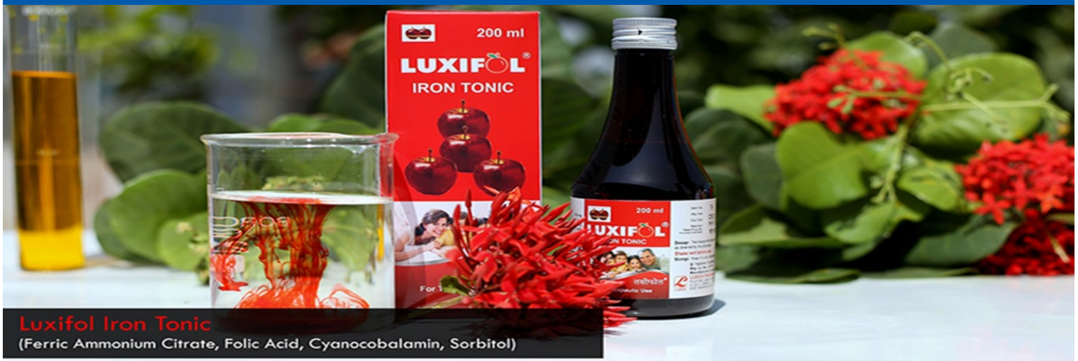
Luxifol Iron Tonic (Ferric Ammonium Citrate, Folic Acid, Cyanocobalamin, Sorbitol)

3rd Party Manufacturing, Albendazole Suspension, Aloe Vera & Vitamin E Cream, Ammonium Chloride Bromhexine Dextromethorphan Syrup, Antacid Syrup, Anti Acne Soap, Antiseptic Liquid, Appetite Stimulant Syrup, Azithromycin Suspension, Azithromycin Suspension 100mg, Beclomethasone & Miconazole Lotion, Beclomethasone, Neomycin & Miconazole Cream, Benzoyl Peroxide GEL, Benzydamine Hydrochloride Mouthwash, etc.