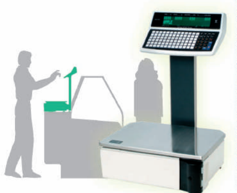
SM-100EV+: Elevated Type 74 Preset Keys