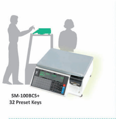
SM-100BCS+ 32 Preset Keys

This series provides the best value for your store's operation.