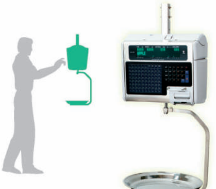
SM-100H+: Hanging Type 76 Preset Keys