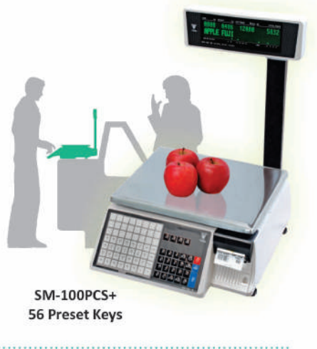
SM-100PCS+ 56 Preset Keys