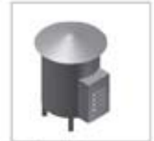
Vertical Motor Guard Canopy