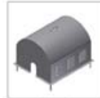
Motor Guard Canopy