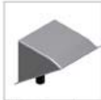
Single Transmitter Canopy