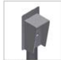
Push Button Canopy