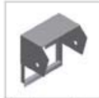
Single Transmitter Canopy (Fab.)