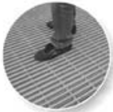
Fiberglass Pultruded Gratings