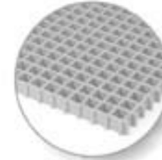
Fiberglass Molded Gratings