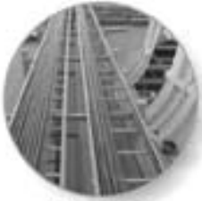
Fiberglass Cable Tray