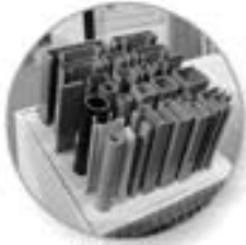
Fiberglass Structural Profiles