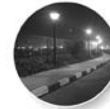
Fiberglass Poles & Mast