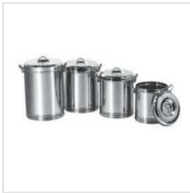
STAINLESS STEELS RATION DABBA 202