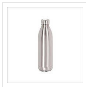
Stainless Steel Hot And Cold Flask