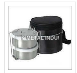
2 Container Tiffin With Pouch