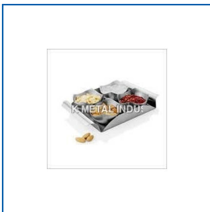
STAINLESS STEEL SNACK BOWLS

2 Container Tiffin With Pouch, 2 Tier Stainless Steel Lunch Box, 3 ply face mask, 4 Container Tiffin with Pouch, 8 PCS Dinner Set, Apple Bowl, Beverage Coasters, Bottle Opener, COLOR PEDAL BINS, Chiller Tank, Chowmein Kadhai with Wooden Handle, Commercial Dustbin, DELUXE BUCKET STAINLESS STEELS 202, Drinking Glass Set, Dual Dustbin, etc.