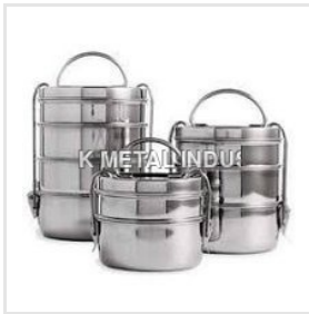
Steel Tiffin Carrier Box