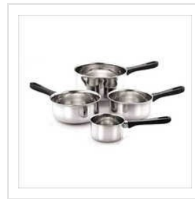
SS Sauce Pan