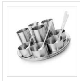
SS 16 Pcs Dinner Set