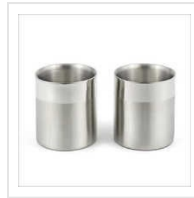
SS Double Wall Cup