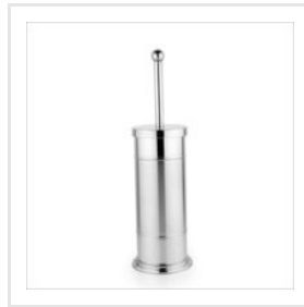
Stainless Steel Toilet Brush Holder