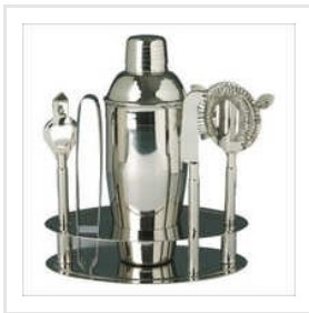
Stainless Steel Bar Set