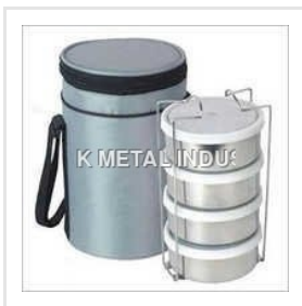
4 Container Tiffin With Pouch