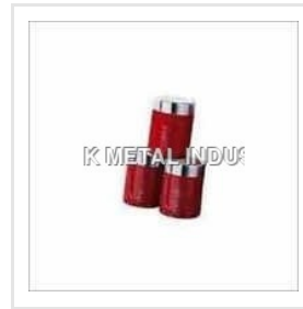
Stainless Steel Coffee Canister