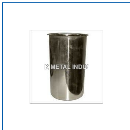
STAINLESS STEEL STORAGE CONTAINER