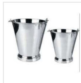
STAINLESS STEELS FATKA BUCKET 202