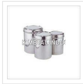
Stainless Steel Canisters