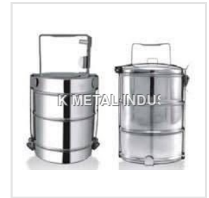
Steel Tiffin Boxes