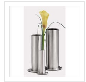
SS Flower Vases