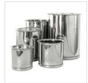
STAINLESS STEELS PAWALI 202