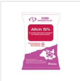
Allcin 15% Non Antibiotic Growth