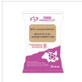
Beta-Glucan Complex Animal Feed