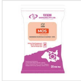
Mos Mannan Oligosaccharide-30%