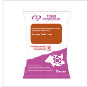
Phytase Animal Feed Supplement