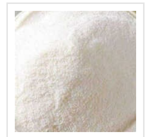
VBPL-CDP Calcium D-Pantothenate