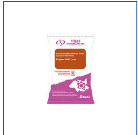
PHYTASE ANIMAL FEED SUPPLEMENT