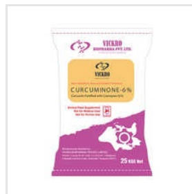
Curcuminone-6% Non Antibiotic Natural