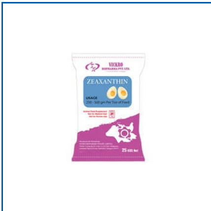
ZEAXANTHIN ANIMAL FEED SUPPLEMENT

Allcin 15% Non Antibiotic Growth Promoter, Alpha Mono Laurin Animal Feed Supplement, Beta-Glucan Complex Animal Feed Supplement, Bile Acids, Calcium Granules, Cinsapin Non-Antibiotic Natural Growth Promoter, Citrus Bioflavonoid-10%, Cocktail Enzyme Premix, Curcuminone-6% Non Antibiotic Natural Growth Promoter, Cyclosin Antibacterial Growth Promoter, Cystamine HCL-50% Animal Feed Supplement, L-Ascorbate-2-Phosphate Powder, Lysozyme Anti Microbial Compound Enzyme, Mos Mannan Oligosaccharide-30% Animal Feed Supplement, Phytase Animal Feed Supplement, etc.