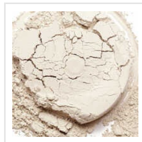
Cocktail Enzyme Premix