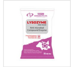
Lysozyme Anti Microbial Compound