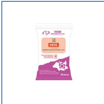
MOS MANNAN OLIGOSACCHARIDE-30% ANIMAL FEED SUPPLEMENT