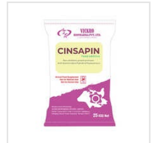
Cinsapin Non-Antibiotic Natural