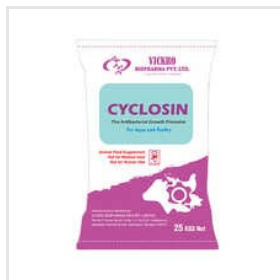
Cyclosin Antibacterial Growth Promoter