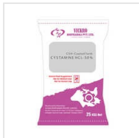
Cystamine HCL-50% Animal Feed