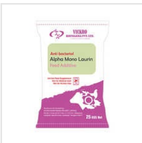
Alpha Mono Laurin Animal Feed