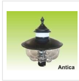
LED Post Top Decorative Luminary