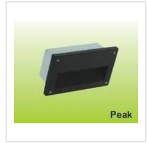
Aluminium Die Cast Wall Recess Step Light