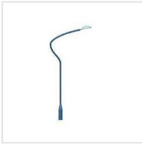
Decorative Street Light Post