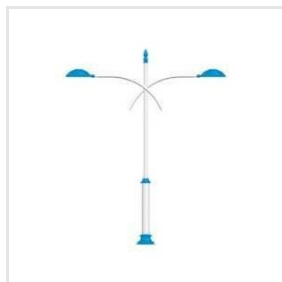
Decorative Street Light Poles