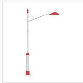
Decorative Light Post