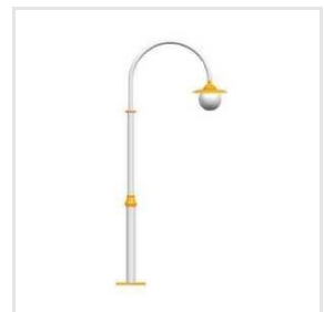
Decorative Street Lamp Post