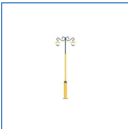
GI LIGHT POLE

Aluminium Antique Pole, Aluminium Decorative Pole, Aluminium Die Cast Wall Recess Step Light, Aluminium Garden Poles, Aluminium Light Post, Aluminium Pole, Aluminium Post, Aluminium Spinning Pathway Light, Aluminium Street Light Pole, Aluminium Street Light Post, Aluminium Vintage Pole, Antique Post Top Pole, Bananal Pole, Banner Arms, Banner Brackets Poles, etc.