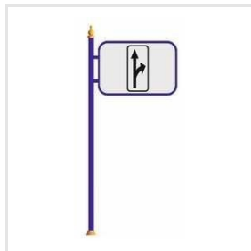
Directional Signage Pole