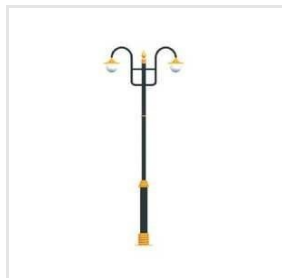
Decorative Street Light Posts