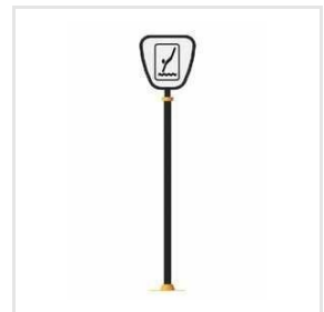
Road Safety Signage Pole