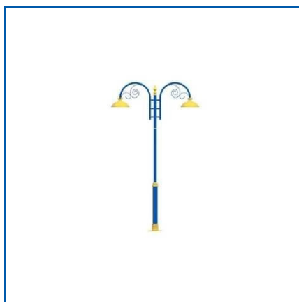
DECORATIVE STREET LIGHT POLE