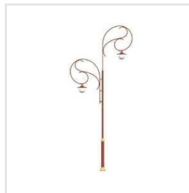
Decorative Street Lighting