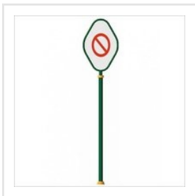
Traffic Sign Pole