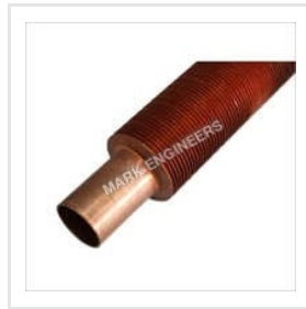
Copper Finned Tube