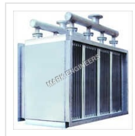
Heat Exchanger For Salt Dryer