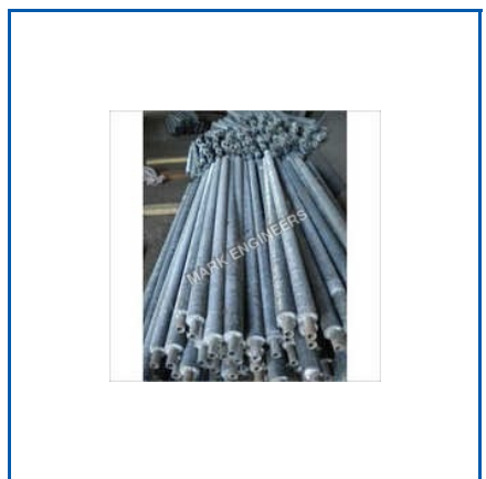
HOT DIP GALVANIZED FINNED TUBES