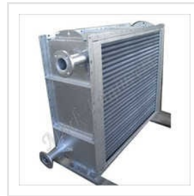
Heat Exchanger For Soya Bean