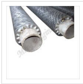
Stainless Steel External Finned Tubes