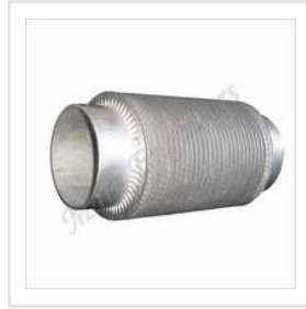
Stainless Steel Finned Tubes