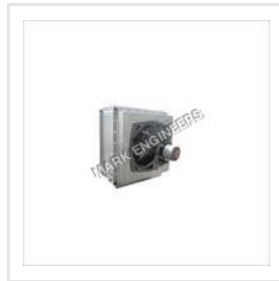
Heat Exchanger For Corn Flake Dryer