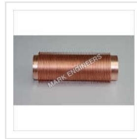
Brass Finned Tubes