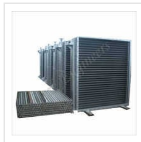
Food Heat Exchangers