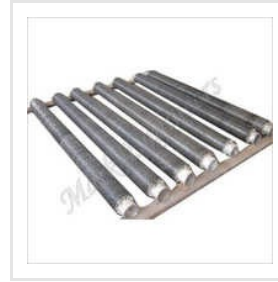
Spiral Finned Tubes