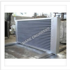
Heat Exchanger For Stenter Dryer Heater