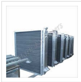
Heat Exchanger For Dryer Heater