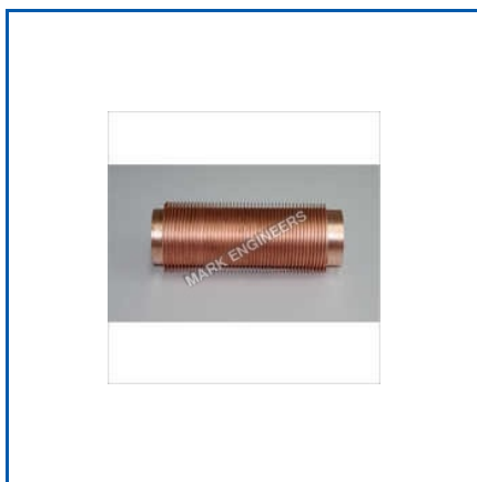
SPIRAL COPPER FINNED TUBES