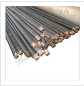
Elliptical Type Finned Tubes