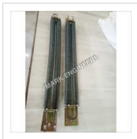
Finned Strip Heaters