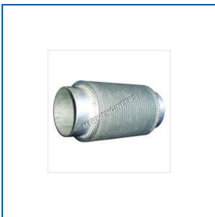
MS FIN TUBES

Air Cooled Heat Exchangers, Brass Finned Tubes, Copper Finned Tube, Dryer Heat Exchanger, Electric Heater Finned Coil, Elliptical Type Finned Tubes, Finned Strip Heaters, Flat Bed Printing Textile Heater, Fluid Bed Dryer Heat Exchanger, Fly Ash Brick Oil Cooler, Food Heat Exchanger, Food Heat Exchangers, Heat Ex-changer For Textile Heater For Stenter, Heat Exchanger For Chemical Tray Dryer Heater, Heat Exchanger For Paddy Dryer Heater, etc.