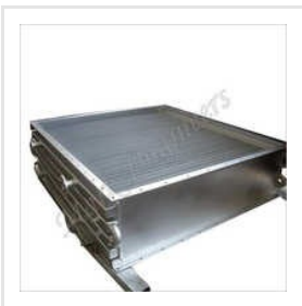
Industrial Food Processing Heat