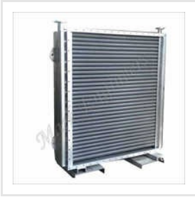
Paddy Dryer Heat Exchanger