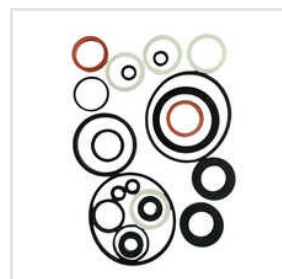
Lathe Cut Rubber Washer