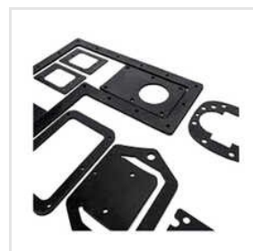
NBR Rubber Gaskets