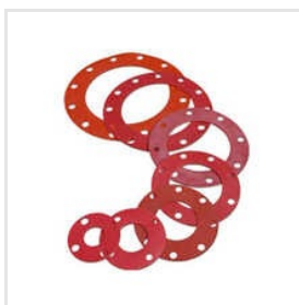
Silicon Rubber Gaskets