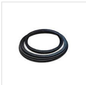
EPDM Rubber Gaskets