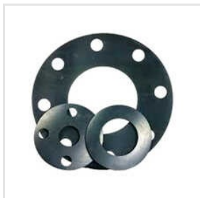
Neoprene Rubber Gaskets