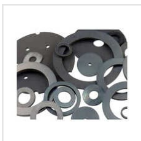
SBR Rubber Gaskets