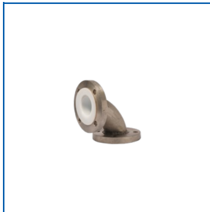
LINED ELBOW 90A AND 45A