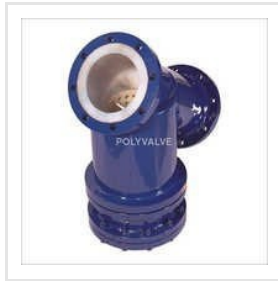
Lined Y Type Strainer