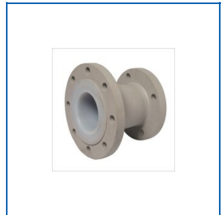
PFA LINED CONCENTRIC AND ECCENTRIC REDUCER