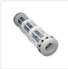
Large Sight Glass