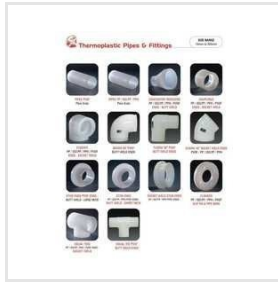
PVDF Pipes Fittings