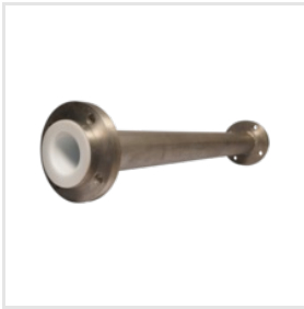
PTFE Lined Pipes