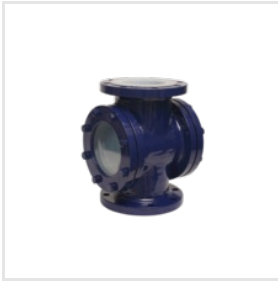
PFA Lined Double Window Sight Glass