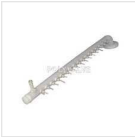
Caustic & Brine Distribution Headers