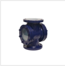
PFA Lined Double Window Sight Glass