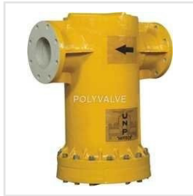
Strainer T Type Large Diameter