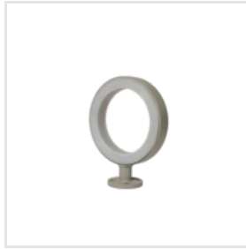
PFA Lined Instrument Tee