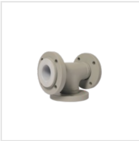
PFA Lined Equal Tee And Unequal Tee