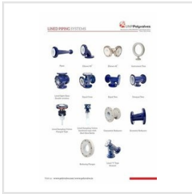
Lined Pipes And Pipe Fittings