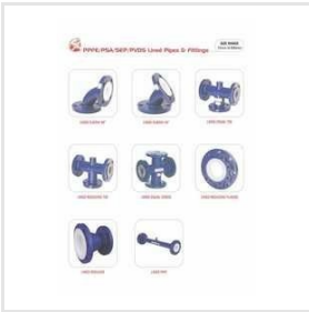
Lined Pipes And Fittings