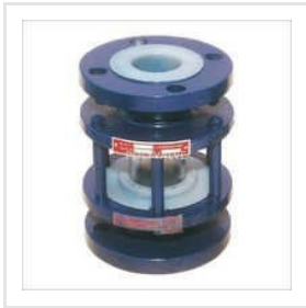
PFA And FEP Lined Sight Glass