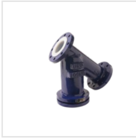
PFA Y Type Strainer