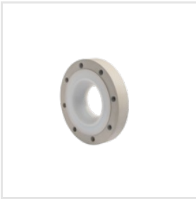
PFA Lined Reducing Flange