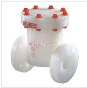
T Type Strainers