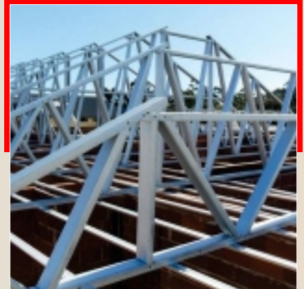
Truss Work Fabrication Work Services