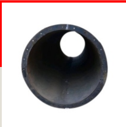
500 Ltr SS Pressure Vessels