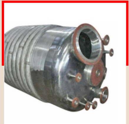
Industrial Stainless Steel Tank