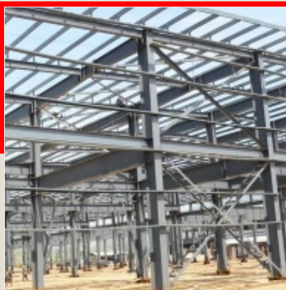
Prefabricated Steel Buildings Fabrication Work Services