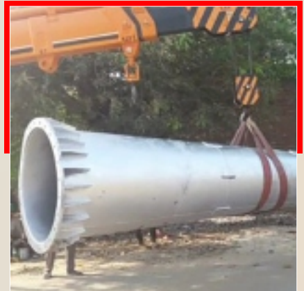
Industrial Mild Steel Chimney