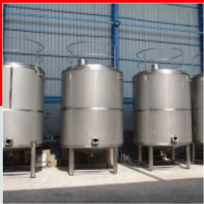
Stainless Steel Storage Tank