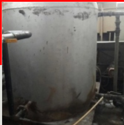
MS Storage Tank