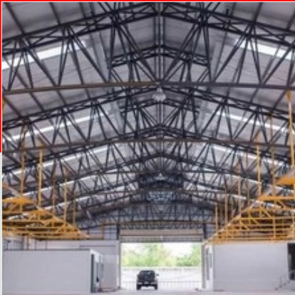
Industrial Sheds Fabrication Services