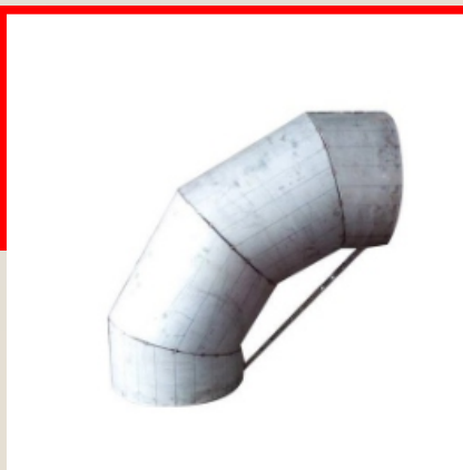
Pipeline Fabrication Services