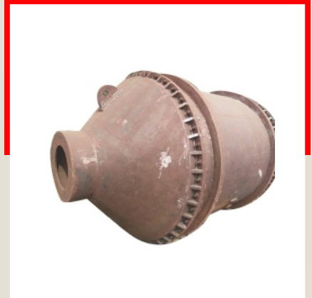
Mild Steel Lead Pot Pressure Vessel