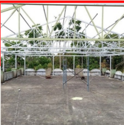
MS Structural Fabrication Services