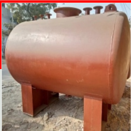
MS Pressure Vessels