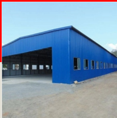
Tin Roof Shed Fabrication Work Services