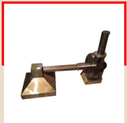
Stainless Steel Hood Blower