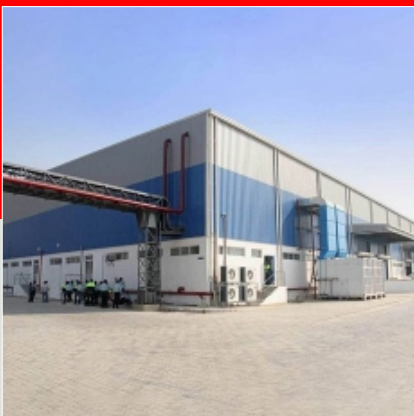
Industrial Prefabricated Warehouse Fabrication Work Services