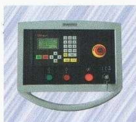
digital control system