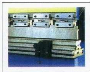
Press brake die