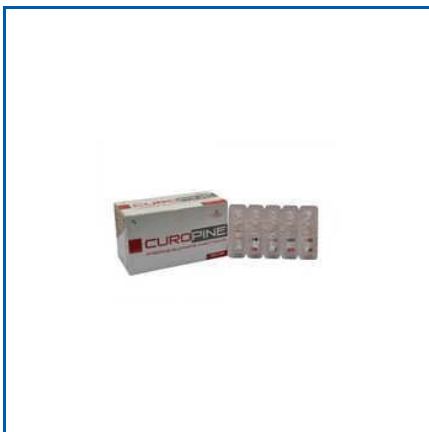
ATROPINE SULPHATE 1 MG/ML INJECTION

Adrenaline Injection, Aminophylline Injection, Atropine Sulphate 1 mg/ml Injection, Atropine Sulphate Injection, Calcium Gluconate Injection, Calcium Gluconate Lactobionate Injection, Calcium Lactobionate Injection, Curevit-12 Vitamin C, Vitamin B12, Folic Acid And Niacinamide Injection, Diclofenac Sodium Injection, Diclofenac Sodium Injection Aqua, Doxofylline Injection, Frusemide Injection, Hyoscine Butylbromide Injection, etc.