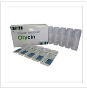
Otycin 5 IU Injection , For Clinical