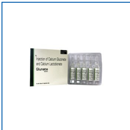
CALCIUM GLUCONATE LACTOBIONATE INJECTION