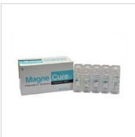
Magnesium Sulphate Injection