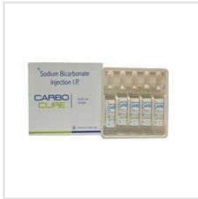
Sodium Bicarbonate 25ml Injection