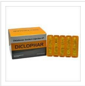
Diclofenac Sodium Injection