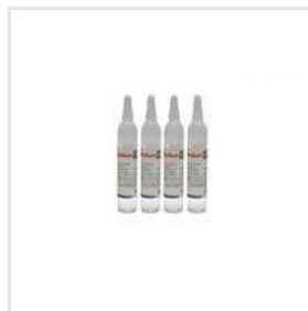
Sodium Chloride Injection