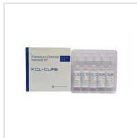
Potassium Chloride Injection