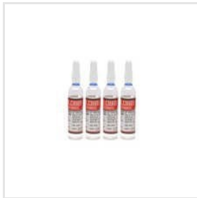
Calcium Gluconate Injection