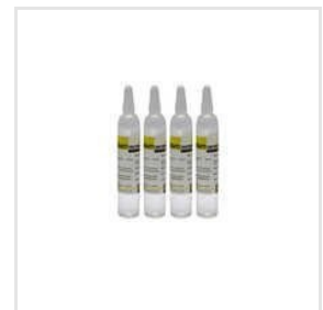
Sodium Bicarbonate Injection