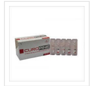
Atropine Sulphate Injection