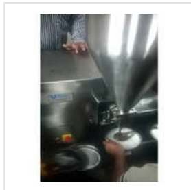
Automatic And Semi Automatic Paste Filling