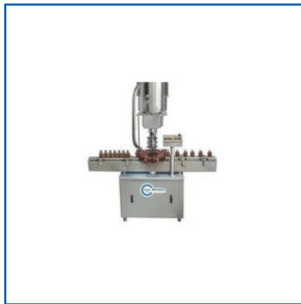
SCREW CAPPING MACHINE