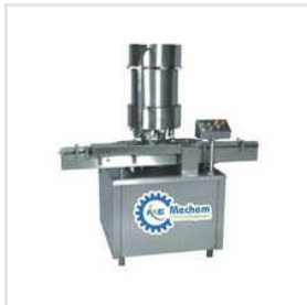
Automatic Vial Sealing Machine