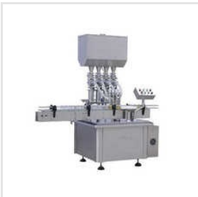
Honey Filling Machine