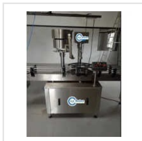
Automatic Crown Cap Sealing Machine