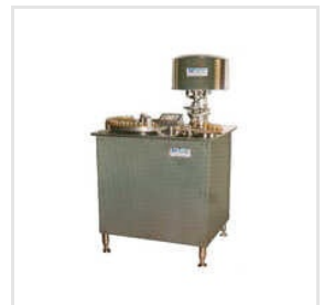
Semi Automatic Aluminium Cap