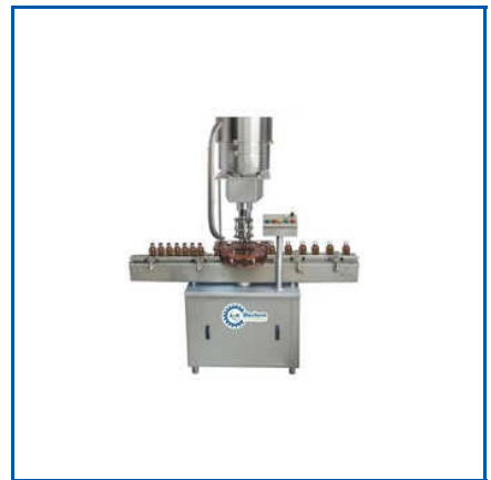
PET BOTTLE SCREW CAPPING MACHINES