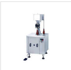
PP Cap Sealing Machine