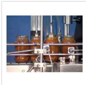
Automatic Pickle Filling Machine