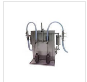
Syrup Filling Machine