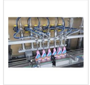
Automatic Servo Based Liquid Filling Machine