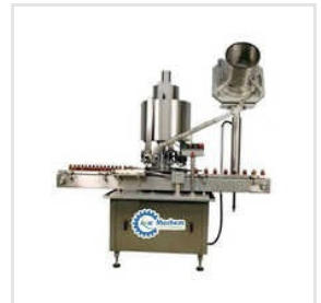
Automatic ROPP Cap Sealing Machine