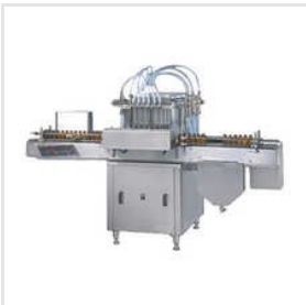
Pesticide Filling Machine