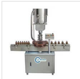
Bottle Capping Machine