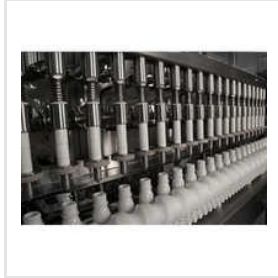
Liquid Soap Filling Machine