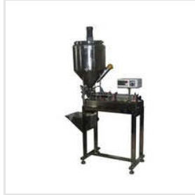
Grease Filling Machine