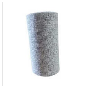
8 Cm RD Cast Bandage