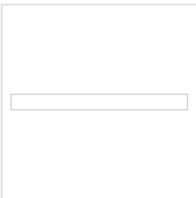
12 Cm RD Cast Plaster Bandage