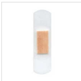
Transparent Band Aid