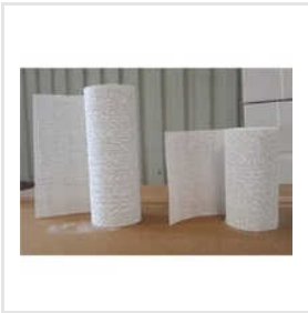
10cm Plaster Bandage