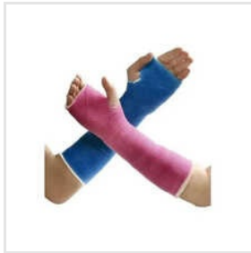
10 Cm Fiber Glass Bandage