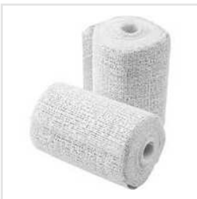
15 Cm RD Cast Bandage