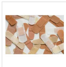
Cotton Band Aid