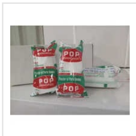
2.7 Mtr Plaster Bandage