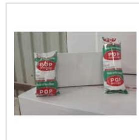
12 Cm White POP Bandage