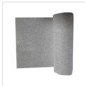
15cm Plaster Bandage