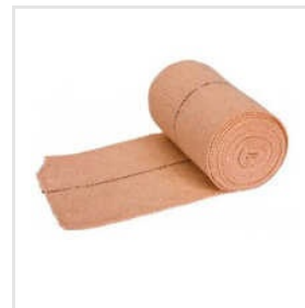
3.5 Mtr Crepe Bandage