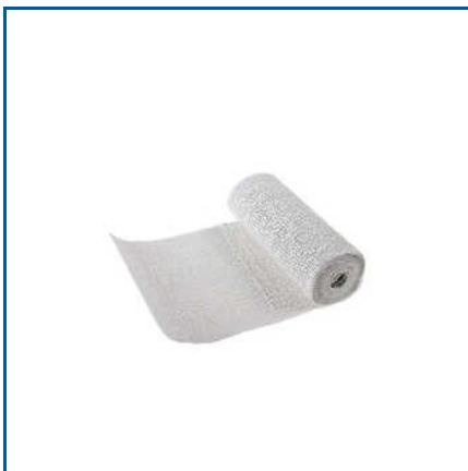
10 CM WHITE PLASTER BANDAGE

10 Cm White Plaster Bandage, 10 cm Fiber Glass Bandage, 10 cm Roller Bandage, 10cm Plaster Bandage, 12 Cm RD Cast Plaster Bandage, 12 cm Cotton Surgical Bandage, 12 cm White POP Bandage, 15 Cm RD Cast Bandage, 15cm Plaster Bandage, 2.7 Mtr Plaster Bandage, 2.7 Mtr Polyester Plaster Bandage, 3.5 Mtr Crepe Bandage, 4 Mtr Crepe Bandage, 8 Cm RD Cast Bandage, Adhesive Plaster Bandage, etc.