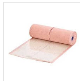
Adhesive Plaster Bandage