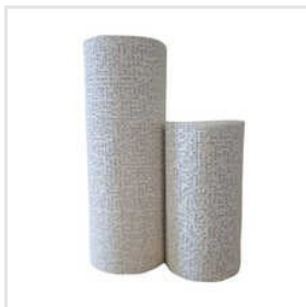
2.7 Mtr Polyester Plaster Bandage