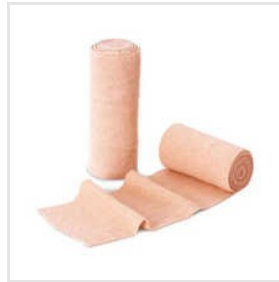
Elastic Crepe Bandage