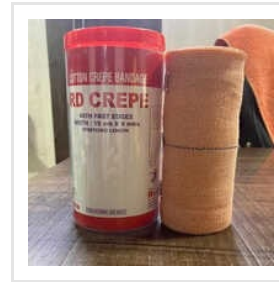
4 Mtr Crepe Bandage