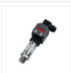
Level Pressure Transmitters