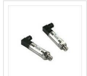
Industrial Pressure Transmitter