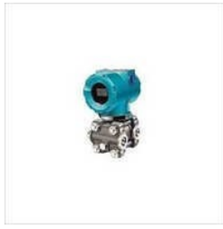
Differential Pressure Transmitter