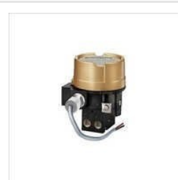
I P Transmitters