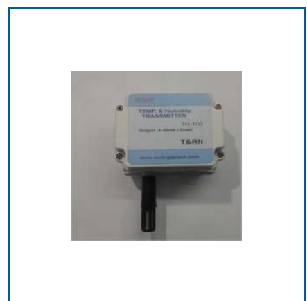
HUMIDITY TEMPERATURE SENSOR RELATIVE HUMIDITY TRANSMITTERS HUMIDITY TRANSMITTER TH-100