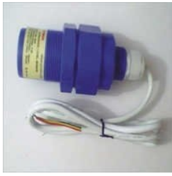
Ultra Sonic Level Sensor