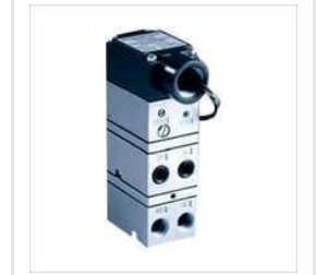
Digital Industrial Pressure Transmitter