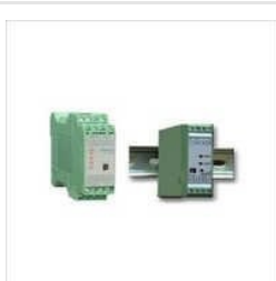
Smart Signal Isolator