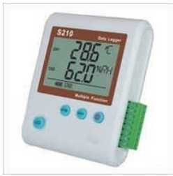
Multinational Data Logger