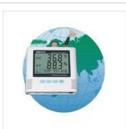
Humidity Data Logger