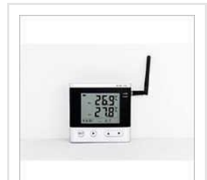
Temperature Data Logger