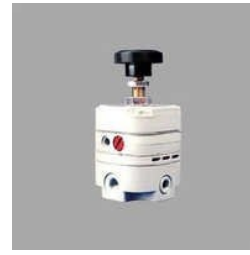
Air Pressure Regulator Transmitter