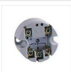
ATX Series Temp Transmitter