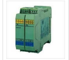
Analog Signal Isolator