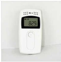
Temperature Data Logger RC4