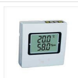
Industrial Temperature Humidity Transmitter