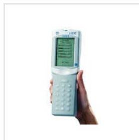
Abbott Blood Analyzer