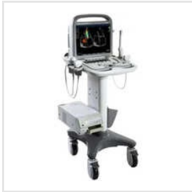
Veterinary Ultrasound Scanner