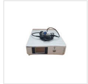
Portable Endoscope Camera