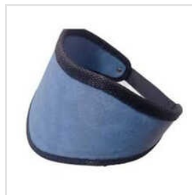
Xray Protective Thyroid Shield