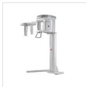
Opg Dental X Ray Machine