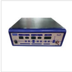
Laparoscopic Co2 Insufflator