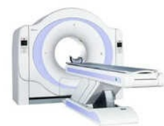
GE REFURBISHED CT SCAN MACHINE