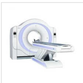
Refurbished CT Scanner