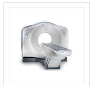
Refurbished CT Scanner