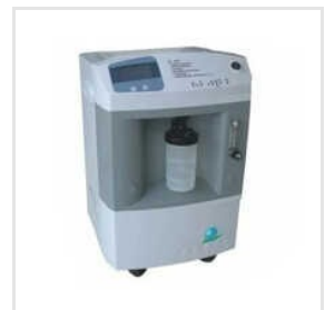
Oxygen Concentrator Machine