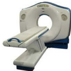
REFURBISHED CT SCAN MACHINE