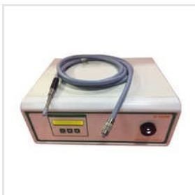
Led Light Source