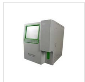
Fully Automated Biochemistry Analyzer