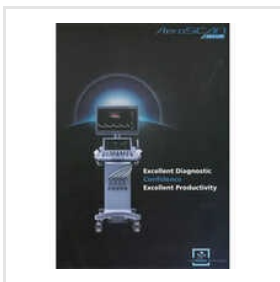
3D And 4D Echocardiogram