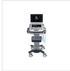
Used Ultrasound Machine