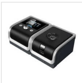
Bmc Bipap Machine