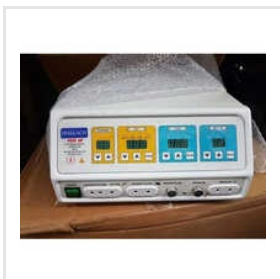
Surgical Diathermy Machine