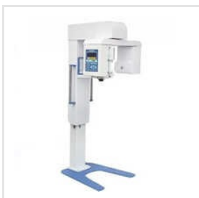
Opg X Ray Machine