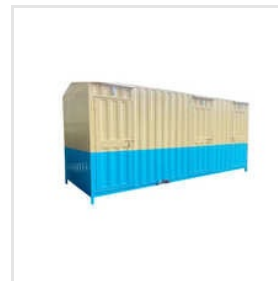
Modular Steel Portable Office Cabin