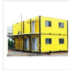
Color Coated Double Storey Portable Cabin