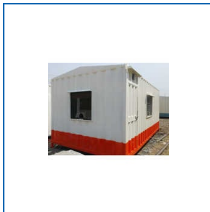
MODULAR OFFICE CABIN