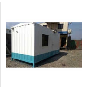
Galvanized Steel Container Cabin