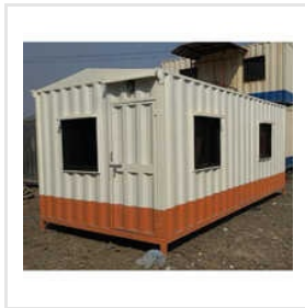
Galvanized Portable Office Cabin