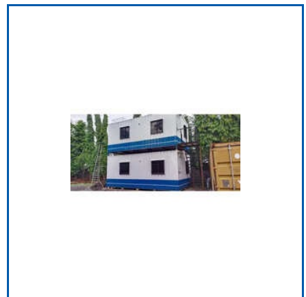
ACCOMMODATION PORTABLE CABIN