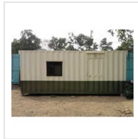
Rectangular Portable Cabin For Office