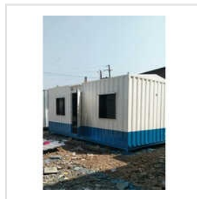
Modular Galvanized Portable Cabin