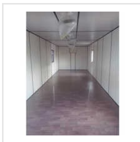
Rectangular Modular Portable Cabin