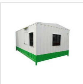
Galvanized Ready Made Steel Office