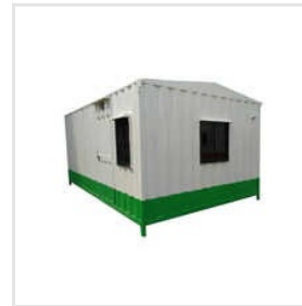
Steel Portable Office Cabin