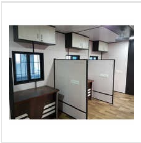
Steel Site Office Executive Cabin