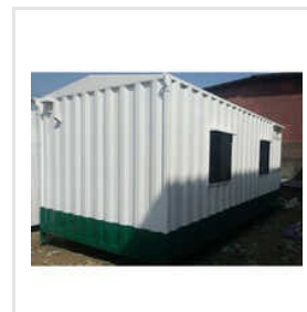
Galvanized Rectangular Portable