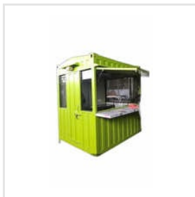
Galvanized Portable Steel Cabin