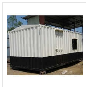
Galvanized Rectangular Office