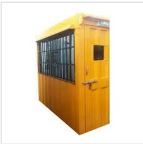
Steel Control Room Portable Cabin