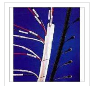
Plastic Spiral Tube