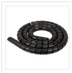
Spiral Wrapping Band