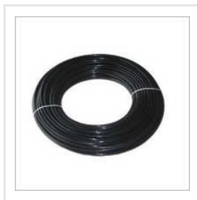
PA- 6 Nylon Tube