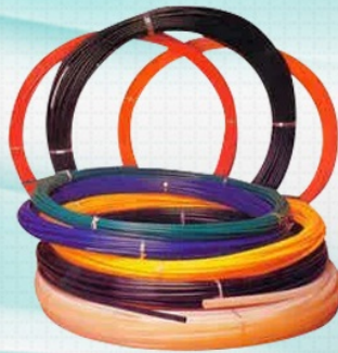
Polyamide Nylon Tube