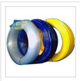
Flexible Nylon Tube