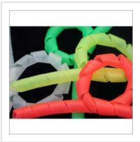
Plastic Spiral Pipes