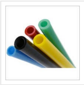
Multicolor Plastic Tube Pipe