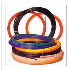
Polyamide Nylon Tube