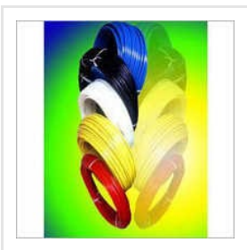
Nylon Water Pipes