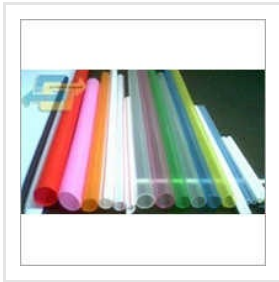
Polypropylene Round Tubes