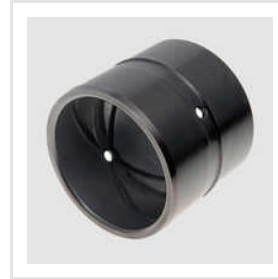
Hardened Steel Bushes