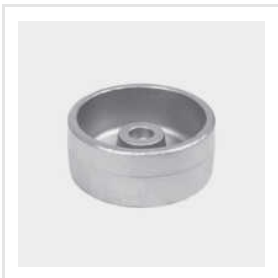
Cam Shaft Break Drum