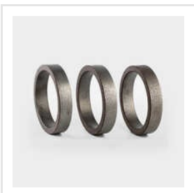
Customize Forged Ring