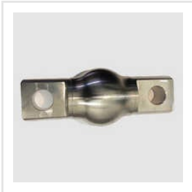
Torque Arm Pin