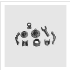
Automotive Metal Components