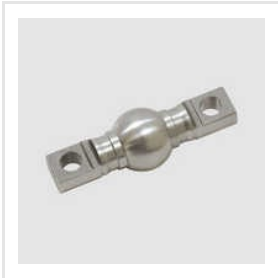
Normal Torque Arm Pin