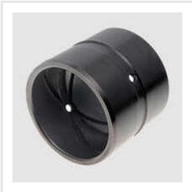
Hardened Steel Bushes