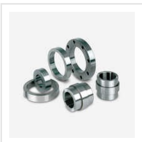
CNC Tured Rings