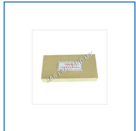
ACID RESISTANT WHITE BRICK