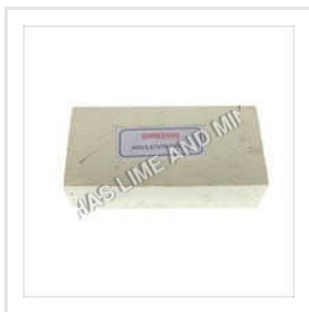
HFK Insulation Brick