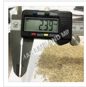
Ceramic Bed Material