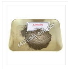
High Alumina Refractory Mortar