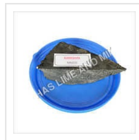
Acid Resistant Mastic Compound