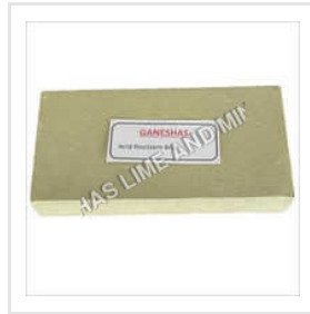
Acid Resistant Refractory Brick