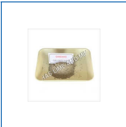
FIRE CRETE SUPER CONVENTIONAL CASTABLES

50 Kg Phoscast 60xr Refractory Castable, 60 Phoscast Refractory Castable, 90 Phoscast Refractory Castable, 90 Refractory Mortar, Acid Resistant Red Shale Bricks, Acid Resistant Mastic Compound, Acid Resistant Refactory Brick, Acid Resistant White Brick, Black Fire Clay Powder, Ceramic Bed Material, Ceramic Fiber Blanket, Fire Clay Type Acid Proof Brick, Fire Crete Conventional Castables, Fire Crete Super Conventional Castables, Furan Based Chemical Resistant Mortar, Etc.