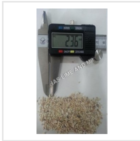
Refractory Bed Material