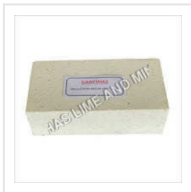
HFK-1260 Insulation Bricks