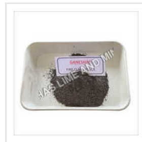
Black Fire Clay Powder