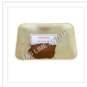
Red Fire Clay Powder