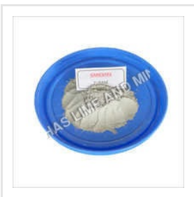
Furan Based Chemical Resistant Mortar