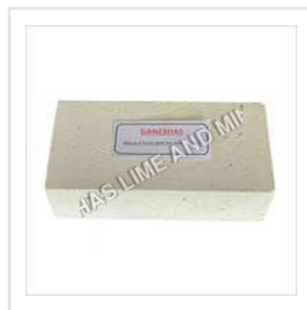
HFK-1460 Insulation Bricks