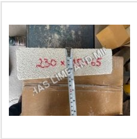
POROSINT INSULATION BRICKS