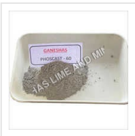
60 Phoscast Refractory Castable