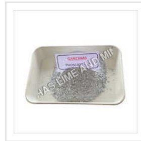
90 Phoscast Refractory Castable