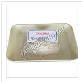
90 Refractory Mortar