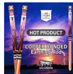
COPPER BONDED EARTH ROD