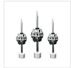
REMEDIES RELA-1 ESE Lightning Arrester