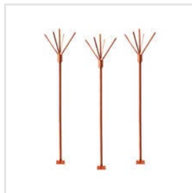
Conventional Lightning Arrester (Copper)