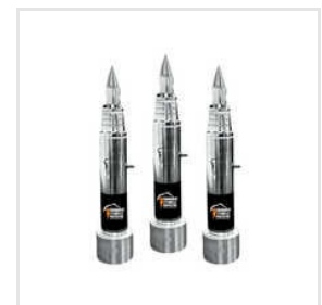
Thunderstroke Protector-30 ESE