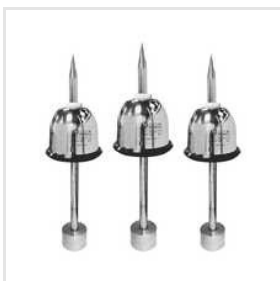
Barq - 30 ESE Lightning Arrester