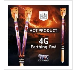
4G Copper Bonded Earth Rod