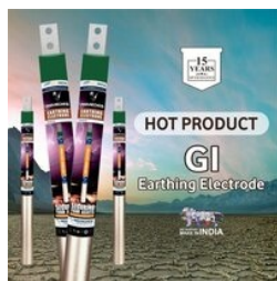
GI EARTHING ELECTRODE