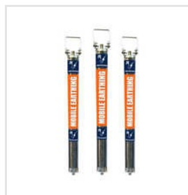
Mobile Earthing Kit