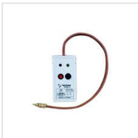
Remedies Lightning Counter Tester