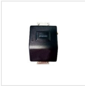
Remedies Lightning Strike Counter