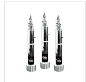
Thunderstroke Protector-60 ESE