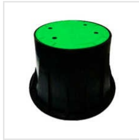
Earth Pit Cover