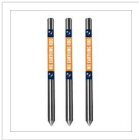
Super Earthing Kit