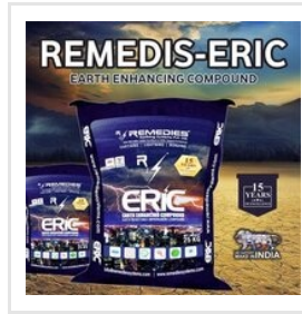
Remedies Eric Backfill Compound