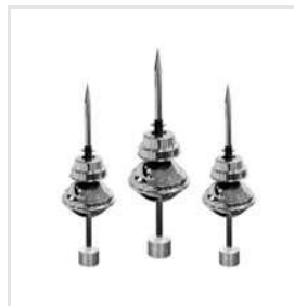
REMEDIES RELA-4 ESE Lightning Arrester