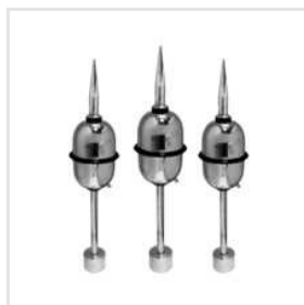
Barq - 60 ESE Lightning Arrester