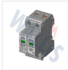
Power Surge Protector